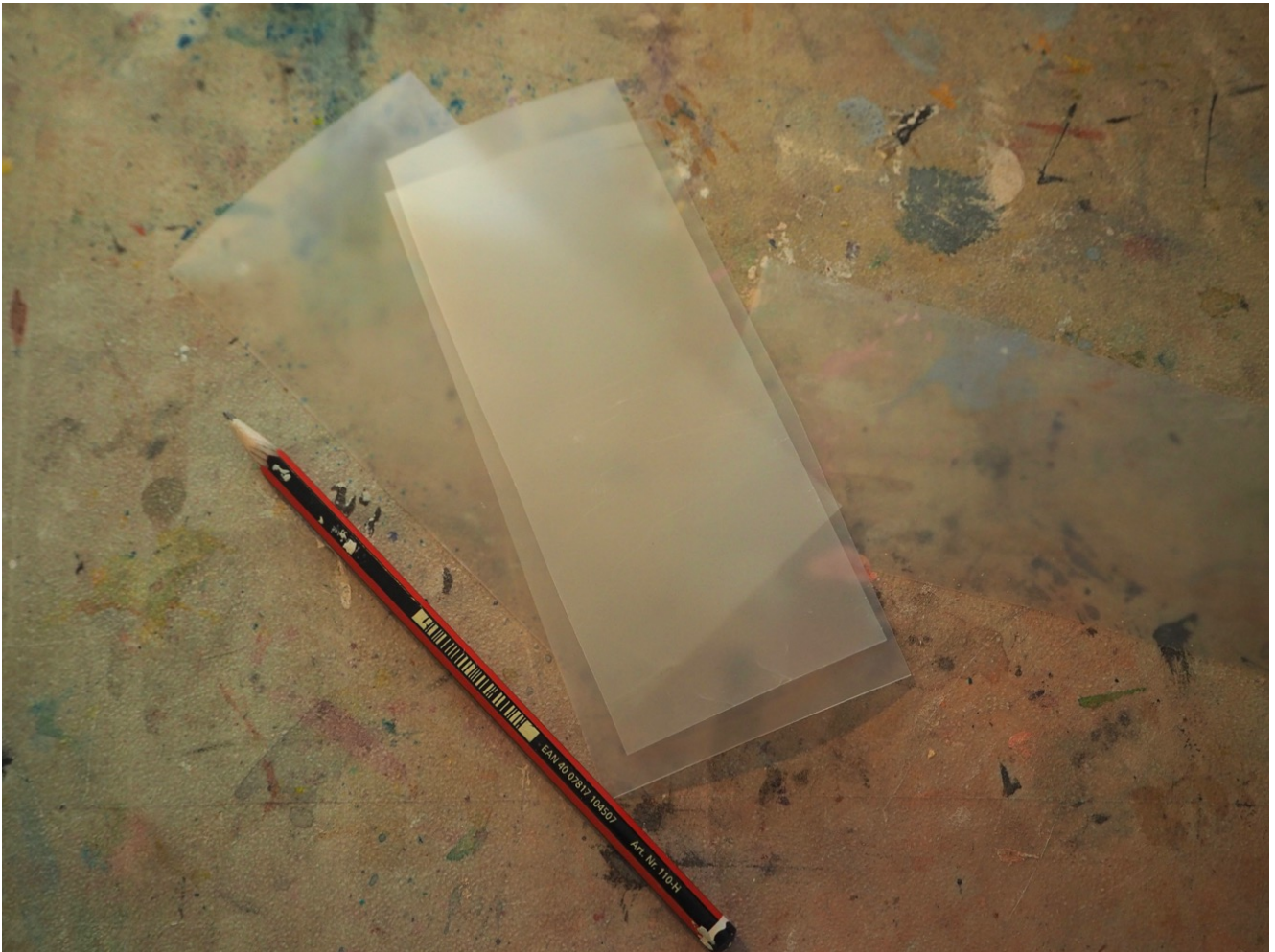
Sheets of Acetate

markers coloured pencils and watercolour to build up layered drawings.