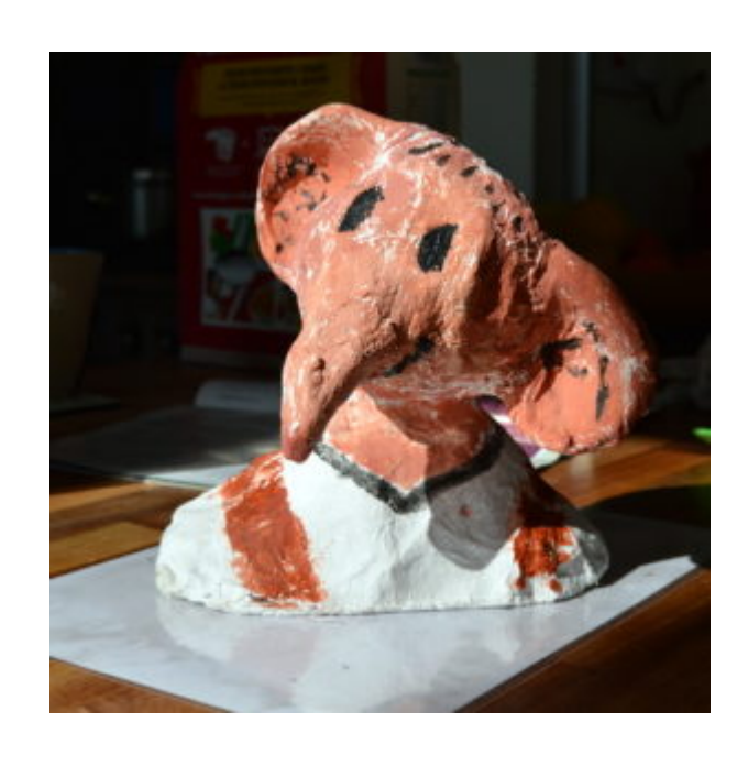
This is featured in the 'Drawing Stories Through Drawing and Making' pathway