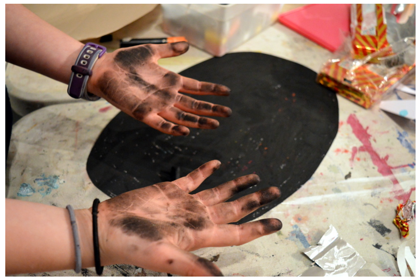
Creative practitioners, educators, teachers, parents, learners...