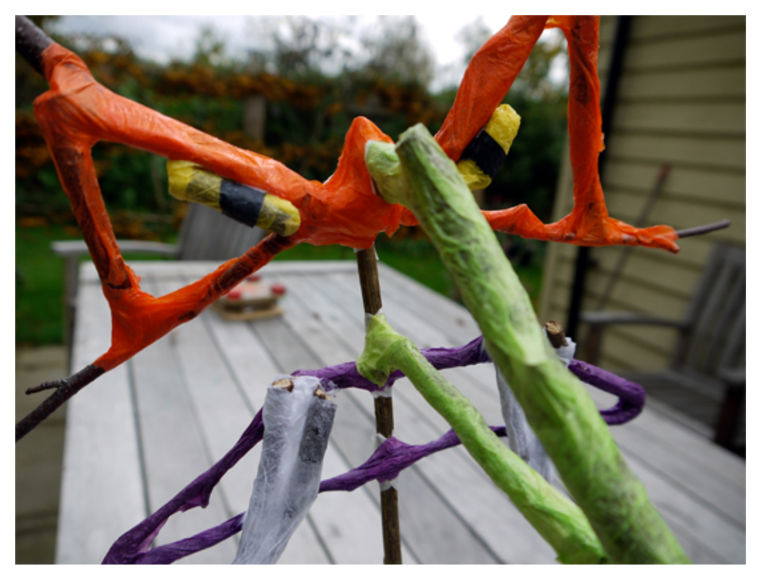
Mask made from sticks and tissue paper

This simple mask is a great making/sculpture/3-d project for children. It's made from sticks, masking tape and tissue paper and is designed to be held by hand in front of the face. Make them as scary and wild as you like - the mask can be easily adapted to be themed to various times of the year, or used to make masks for performances, assemblies, costumes or puppets.