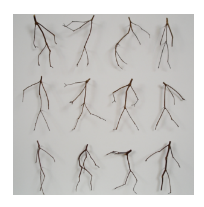
session recording: exploring modroc