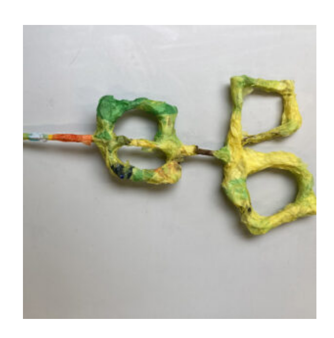
You May Also Like...