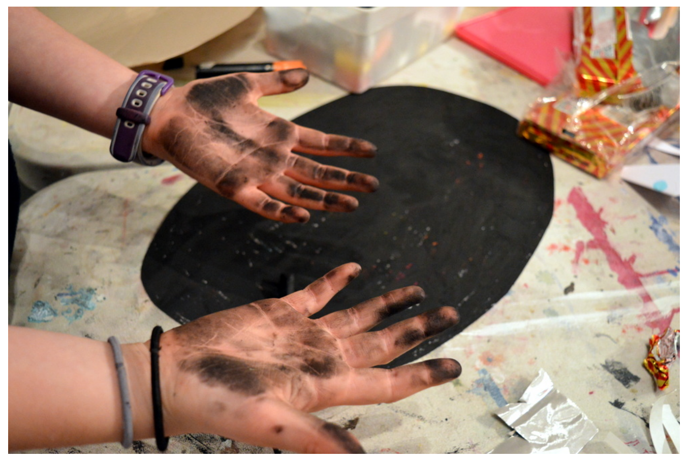
Creative practitioners, educators, teachers, parents,