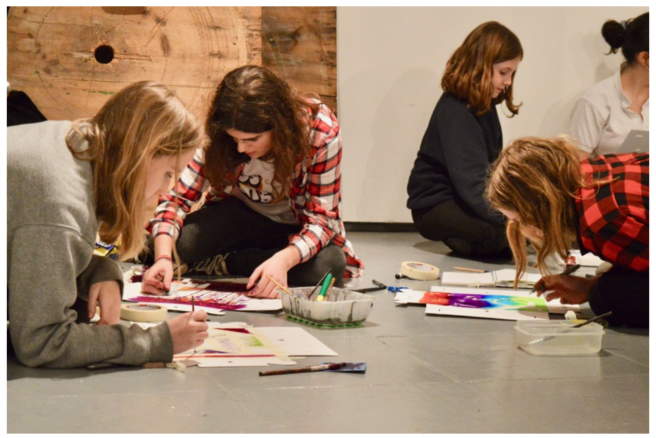
Schools, Colleges, Arts Organisations: Single and Multi-Users From £42

AccessArt is a UK Charity and we believe everyone has the right to be creative. AccessArt provides inspiration to help us all reach our creative potential.