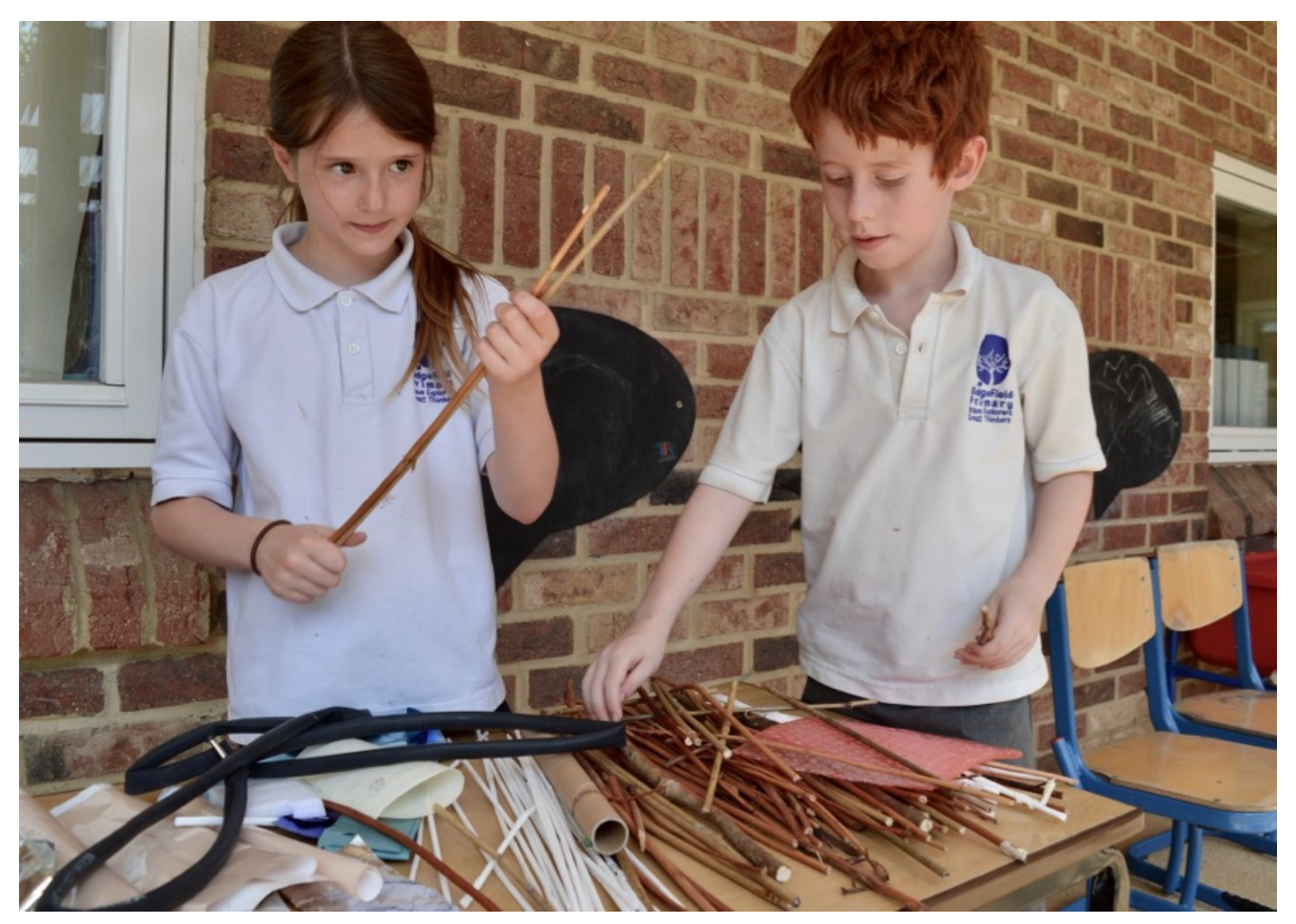
Getting started! Exploring the materials and gathering ideas...

This session was aimed at children who love making, and was limited to eight pupils, to allow for a rich, and rewarding experience and plenty of time to play with, and explore materials.