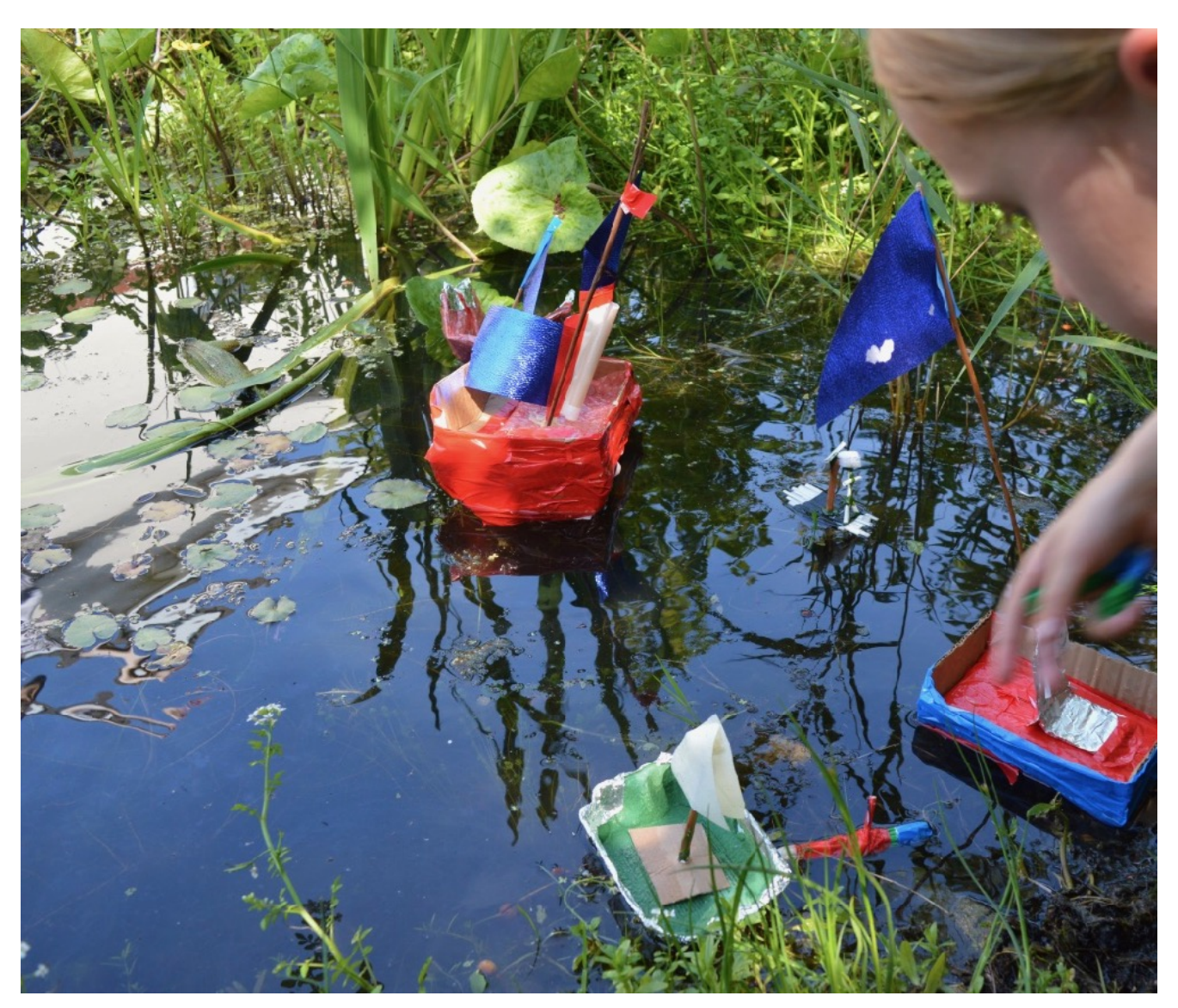
Boats that Float - Workshop with year four pupils at Ridgefield Primary School

This was an afternoon session for year four pupils at Ridgefield Primary School, Cambridge, and part of AccessArt's Brilliant Makers Club, a campaign supporting and championing