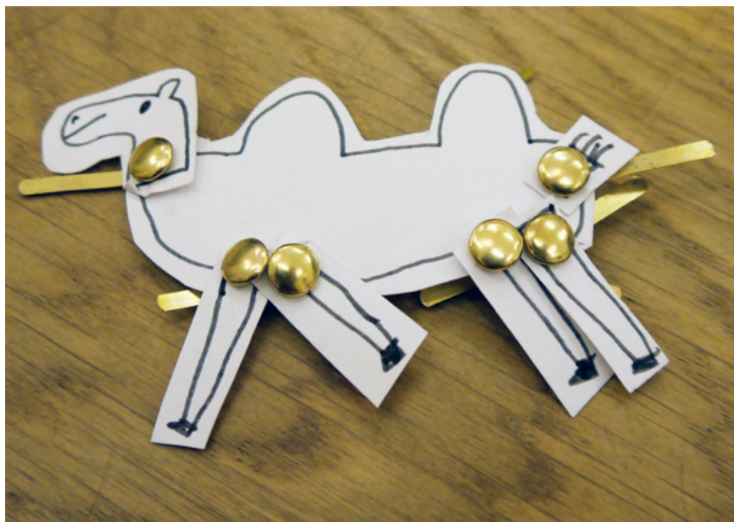
Paper fastener camel

Following on from our School Full of Characters workshop and the Drawing Storyboards with Children workshop, we had great fun this week making drawings move. The children loved the new dimension added to their drawings and there were a lot of giggles as the funny faces emerged!