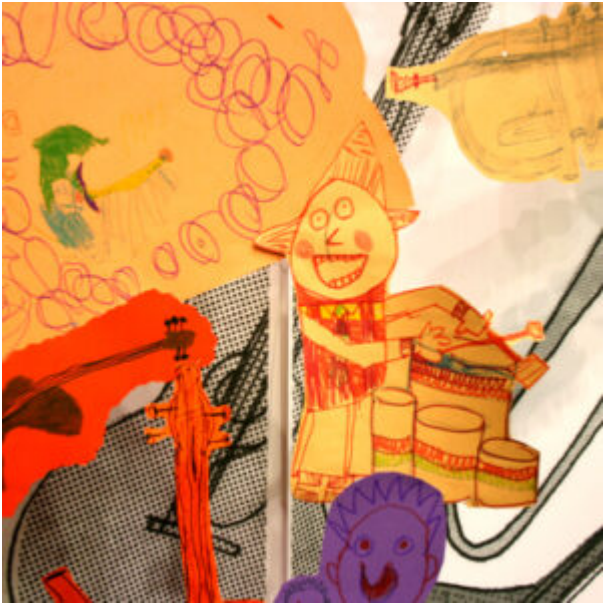
A Cheerful Orchestra