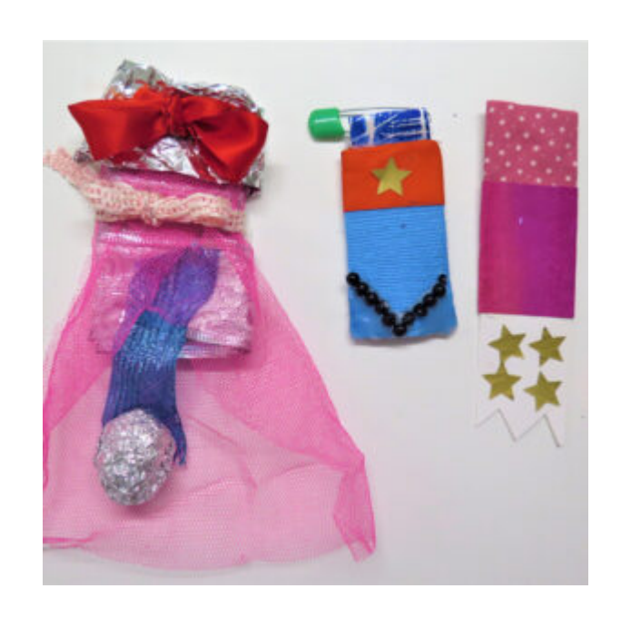
Featured in the 'Playful Making' pathway