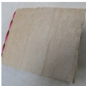
How to make an Elastic band sketchbook

One of the most important parts of the sketchbook project, is that it is about encouraging pupils to become more actively involved with their own learning experiences - to enjoy a sense of control, decision making, and revelation, and to realise that through working in a sketchbook their book takes on a very real and tangible personality - and that that "personality" is actually theirs! This can be a very empowering experience. And this process should start with the actual sketchbook, and not just what's inside. So whilst we provide tips and guidance here, we'd like to encourage teachers to try less to "teach" how to make a sketchbook, and more how to "enable the opportunity" to make a sketchbook, and to see diversions to original plans (by teachers and pupils) as creative adventures!