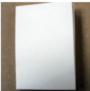
How to make a simple folded sketchbook

AccessArt offers Inset and CPD around Sketchbooks. See our Inset Brochure here , or contact us on 01223 262134, info@accessart.org.uk