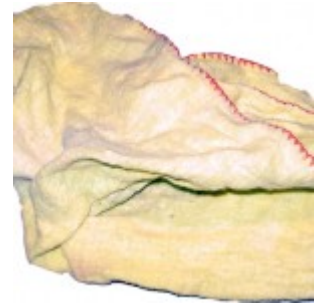
Thinking Creatively about Sketchbooks!

UK Charity AccessArt welcomes artists, educators, teachers and parents both in the UK and overseas.