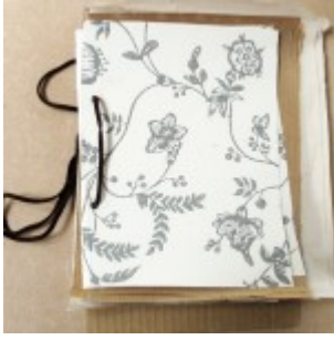
How to make a Hole punch sketchbook