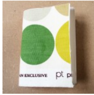
How to make a Sewn together sketchbook