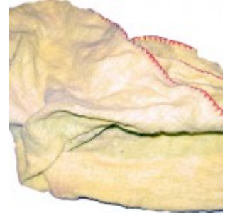
Thinking Creatively about Sketchbooks!

UK Charity AccessArt welcomes artists, educators, teachers and parents both in the UK and overseas.