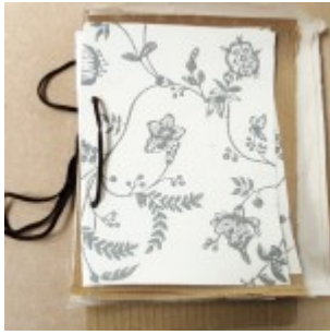
How to make a Hole punch sketchbook