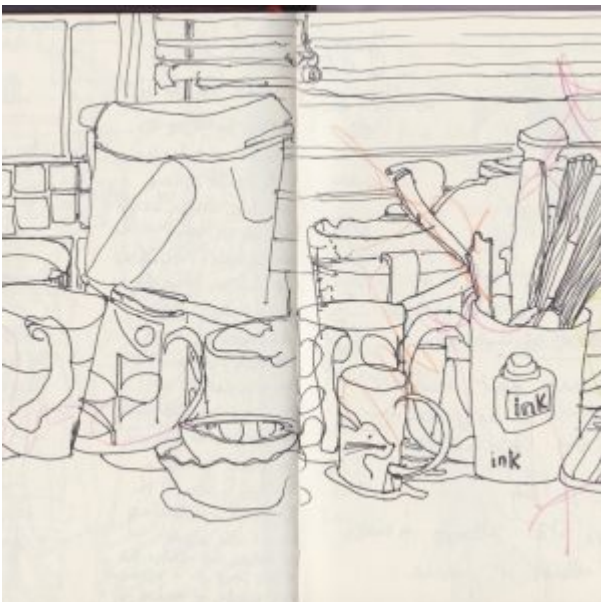
Inspired by Miro