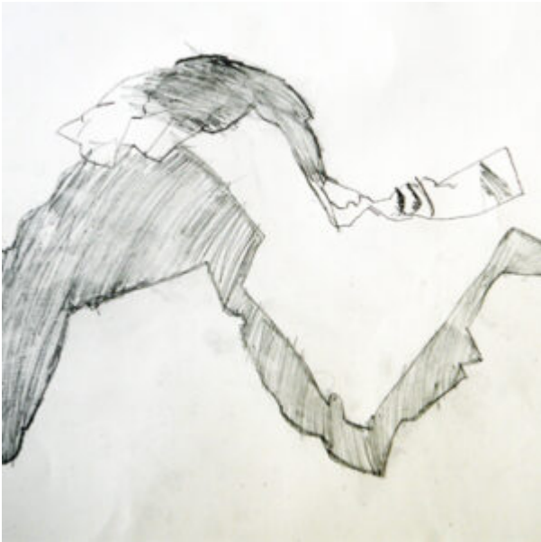
Drawing in the dark