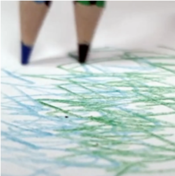
Painting the storm