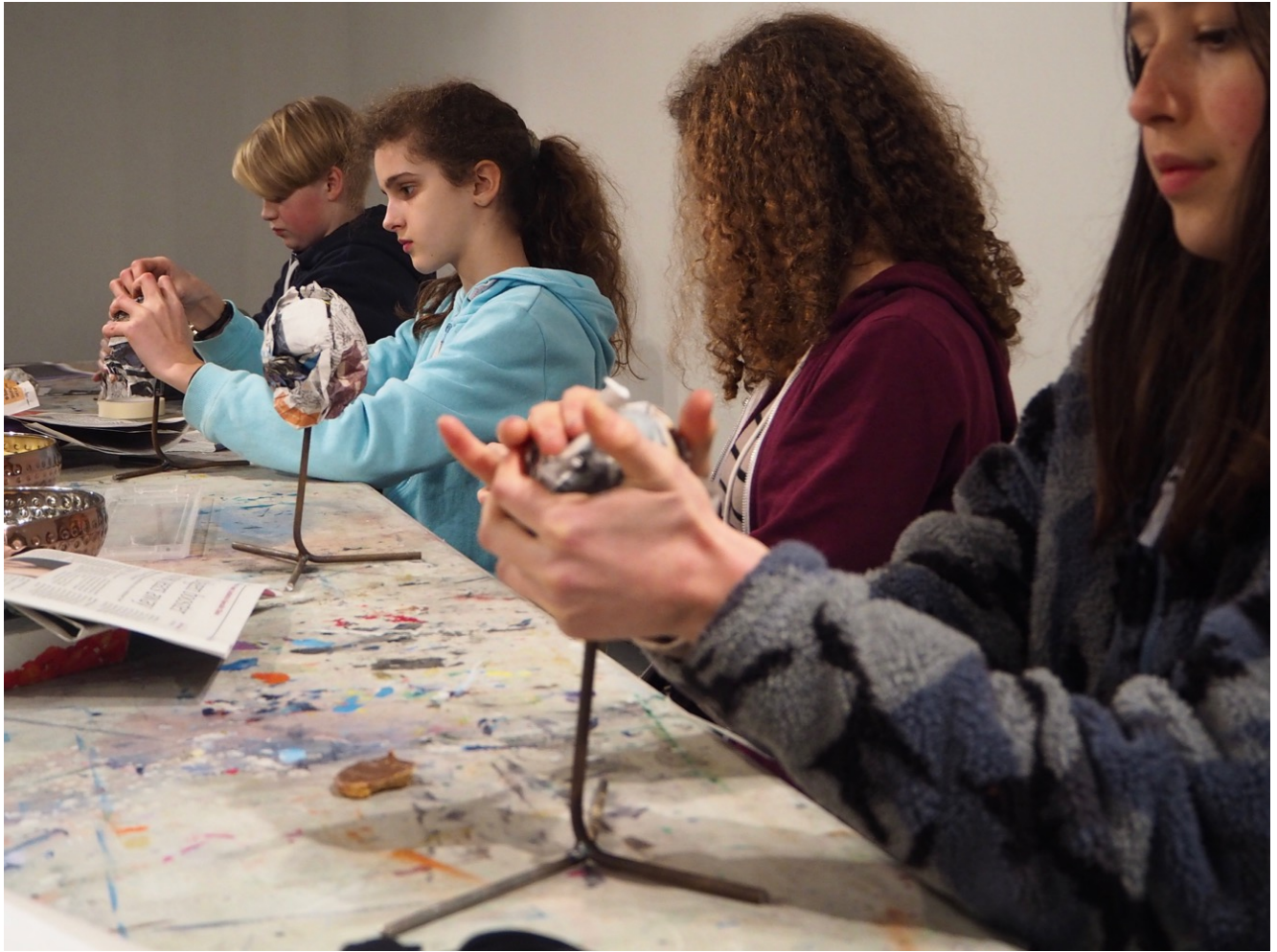
Adding newspaper to the steel armature

begin to add features to. Working this way also give you an option of leaving the clay on the armatures, as we did. As the clay dries, it shrinks, and would crack if the clay were built directly onto a rigid armature. A final advantage of working this way is that if you wish to fire the work, it is easy to cut the form in half, pull out the newspaper and hollow the clay before pressing it back together.