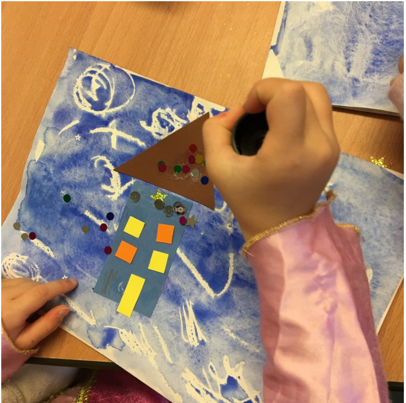
Adding sequins to show 'light through the windows'