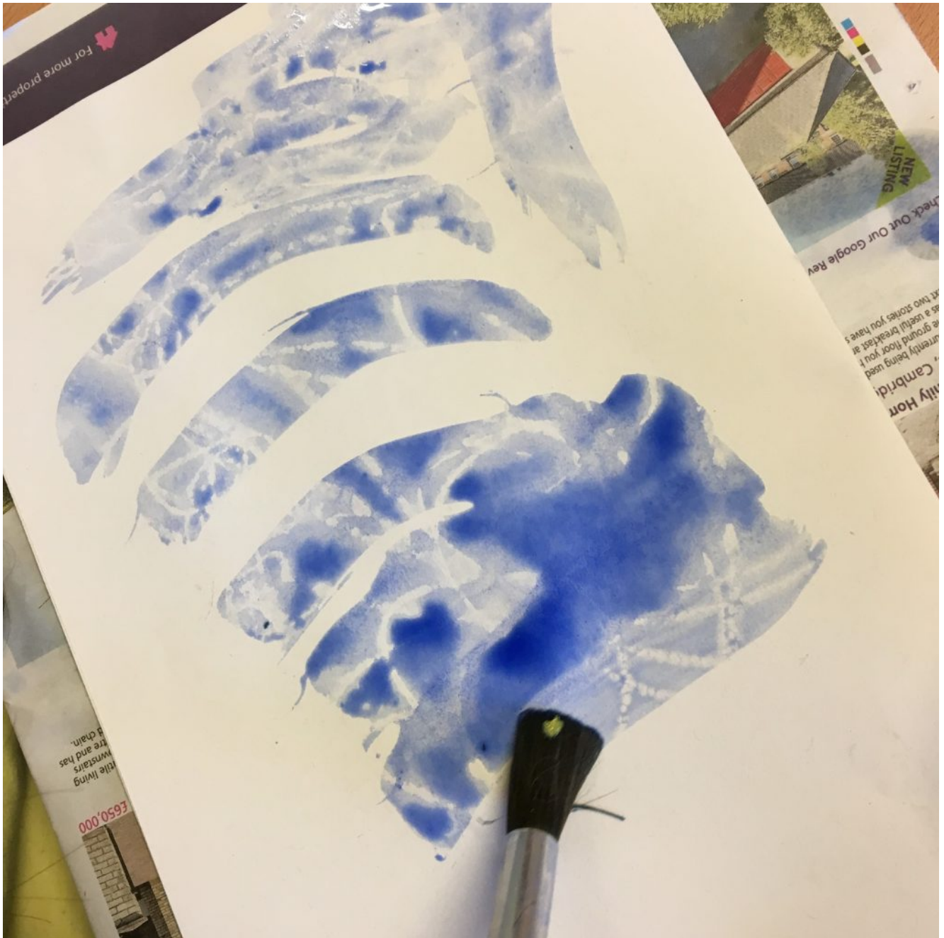
White wax marks appearing through the blue wash