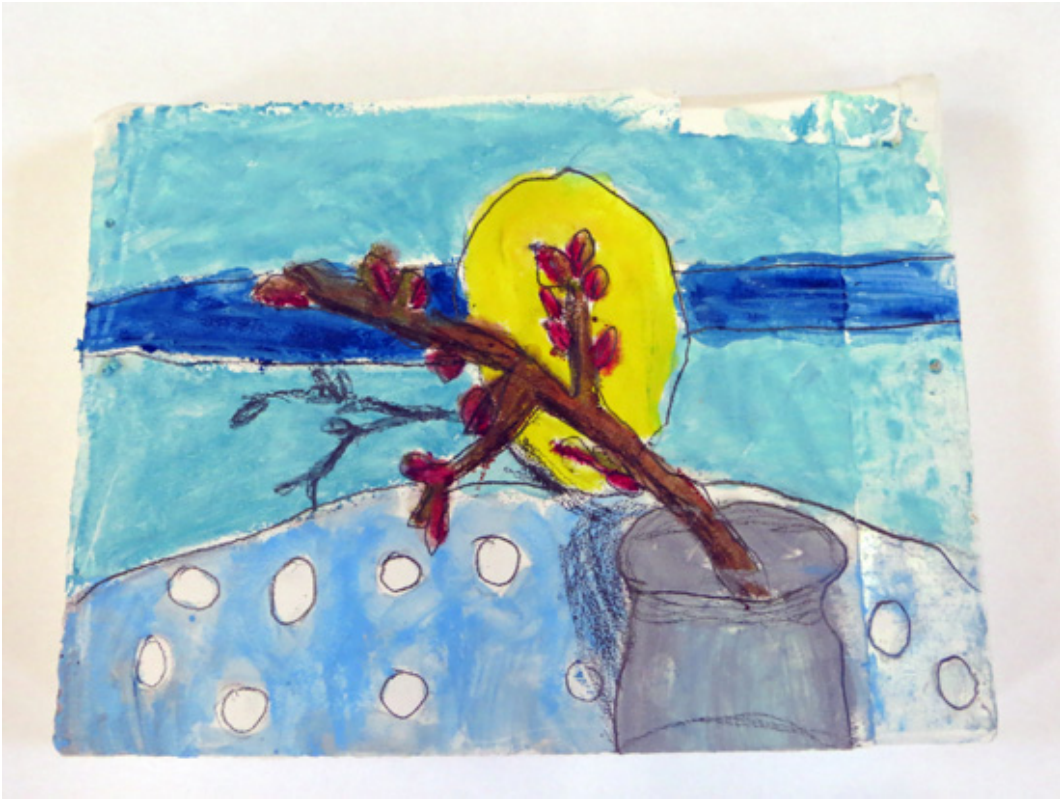
Painting on Plaster