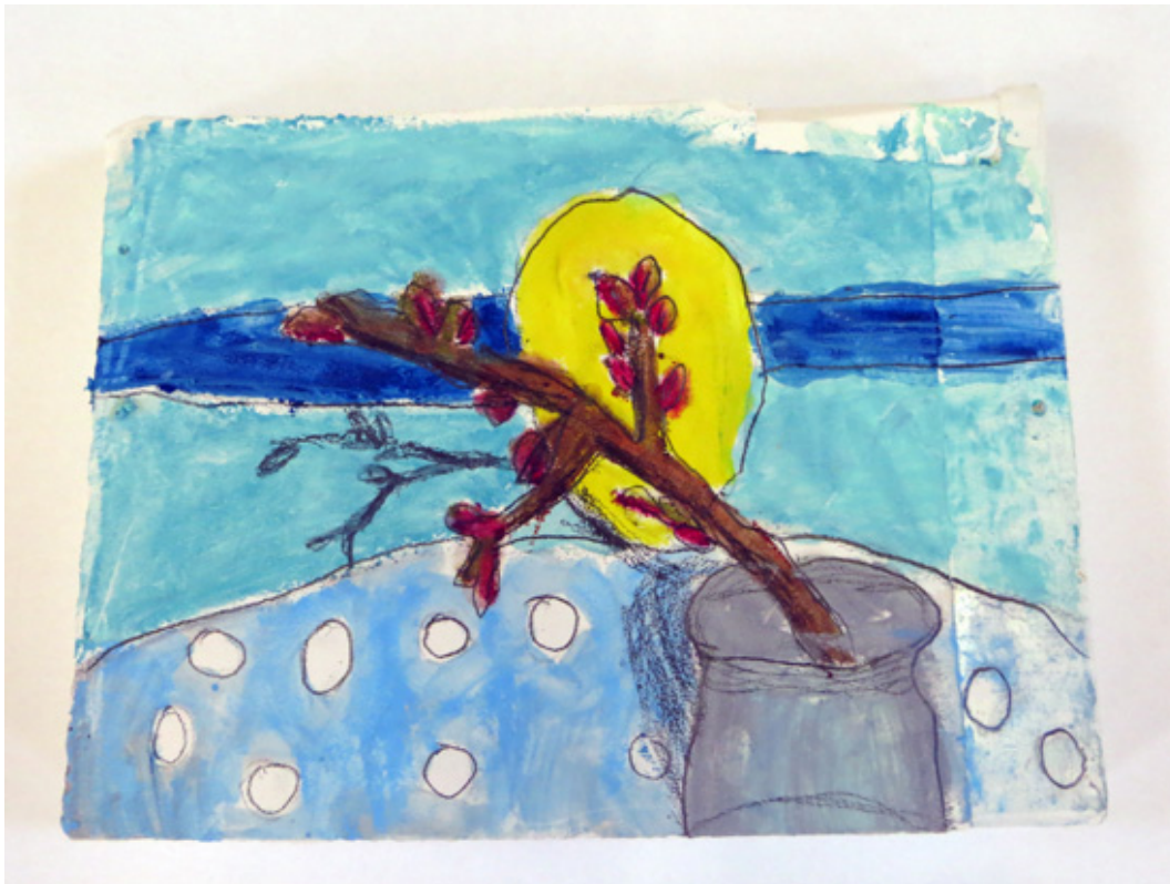
Painting on Plaster