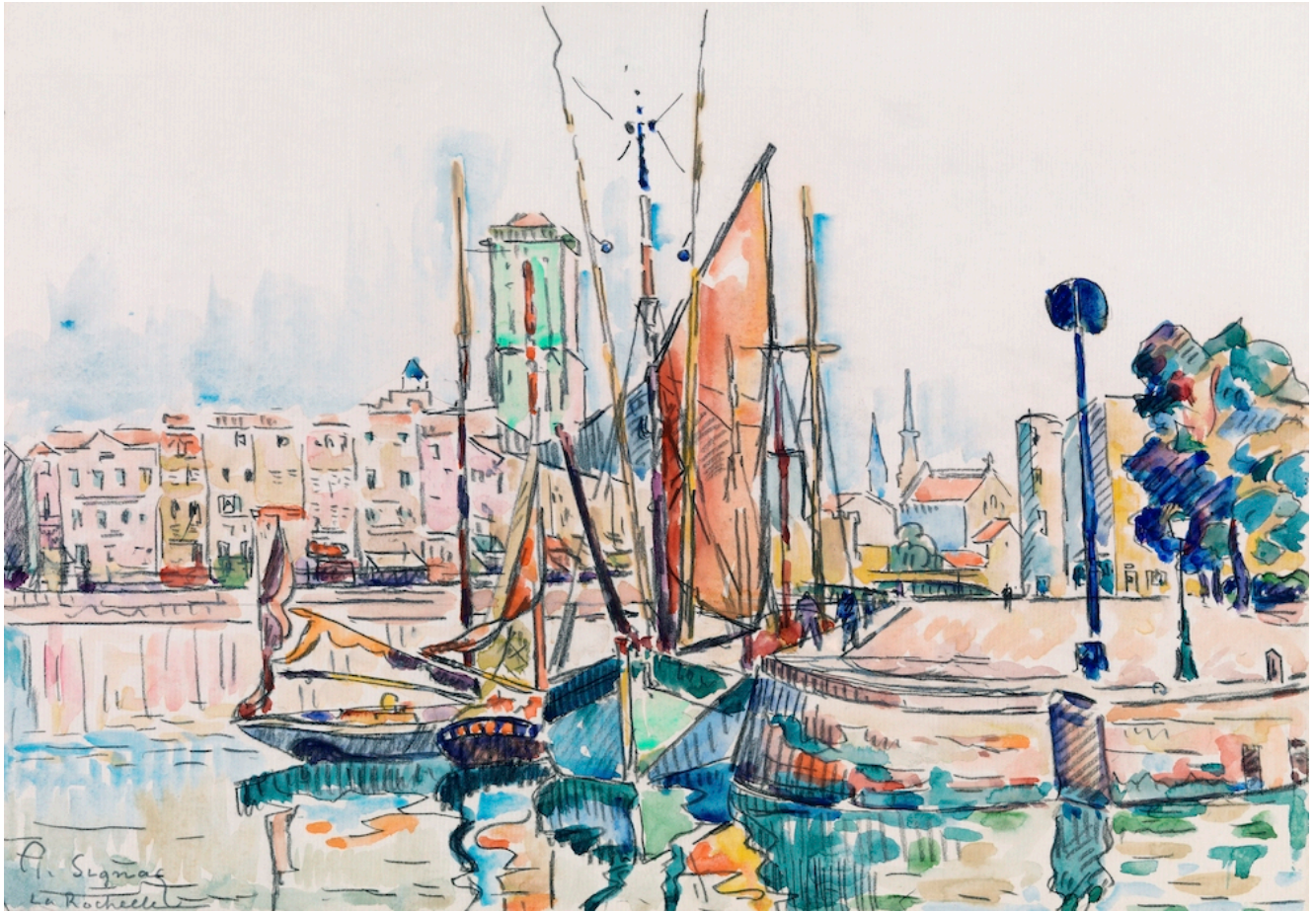
La Rochelle (1911) painting in high resolution by Paul Signac.