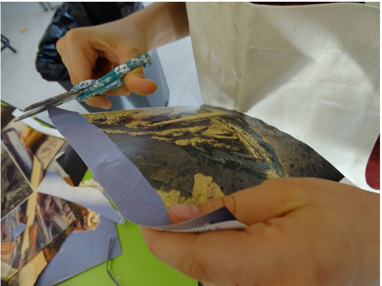
Choosing magazine imagery and creating small sections of collage

To start, the children used magazine imagery to create small square or rectangular sections of collage. We looked at how we could take areas of colour in an image and give it a new context /meaning. For example the colour and texture of a woman's hair might become a field, or a blue grey coat become a stormy sky.