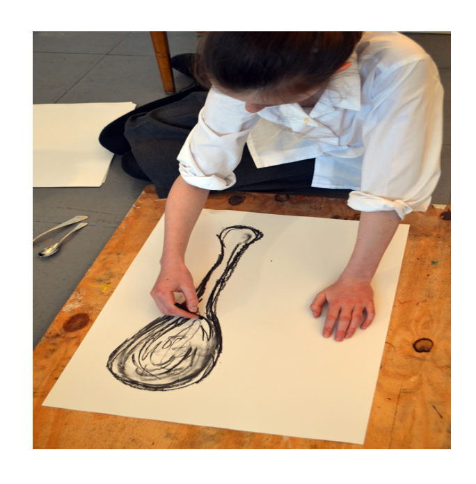
Drawing Shiny Cutlery