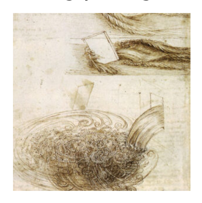
Our River — a Communal Drawing