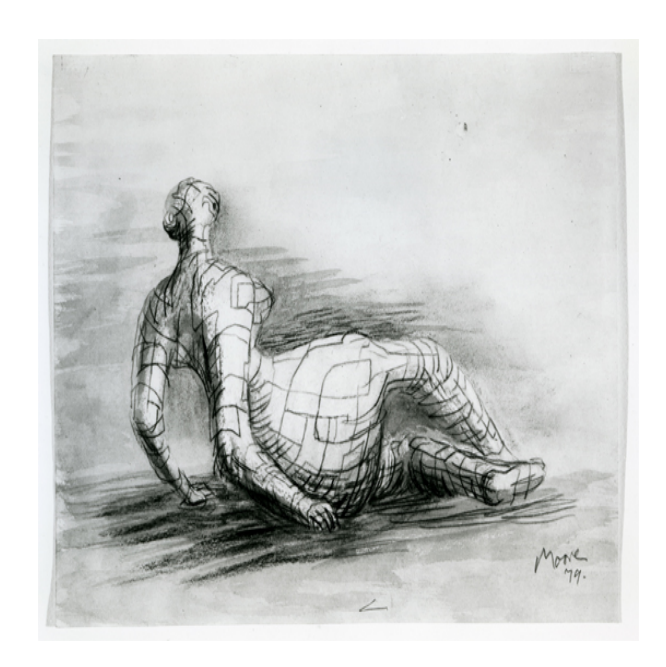
<u>Potatoes, Playmobil and Henry Moore:</u> <u>Making Drawings with Mass</u>