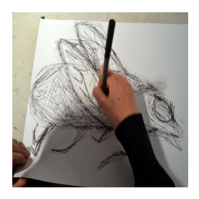
Drawing Insects in Black Pen