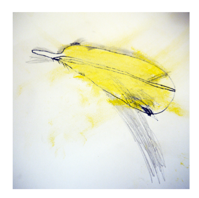
Drawing Feathers: Perfect for Mark Making