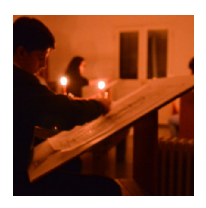
Candlelit Still Life