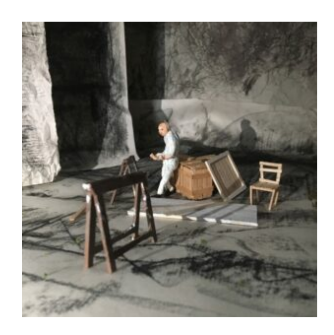
Expressive Charcoal Collage: Coal Mines