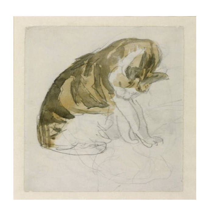
<u>Drawings of Toys Inspired by Gwen John's</u> <a href="mailto:Cats!">Cats!</a>