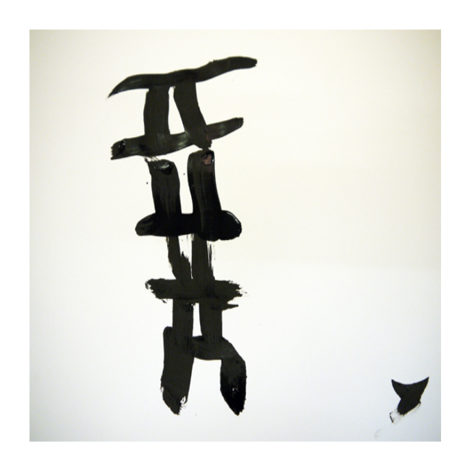
Exploring Ink: Making Drawing Tools and Mark Making