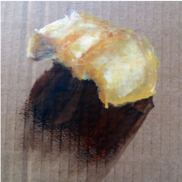
Graphic Inky Still Life!