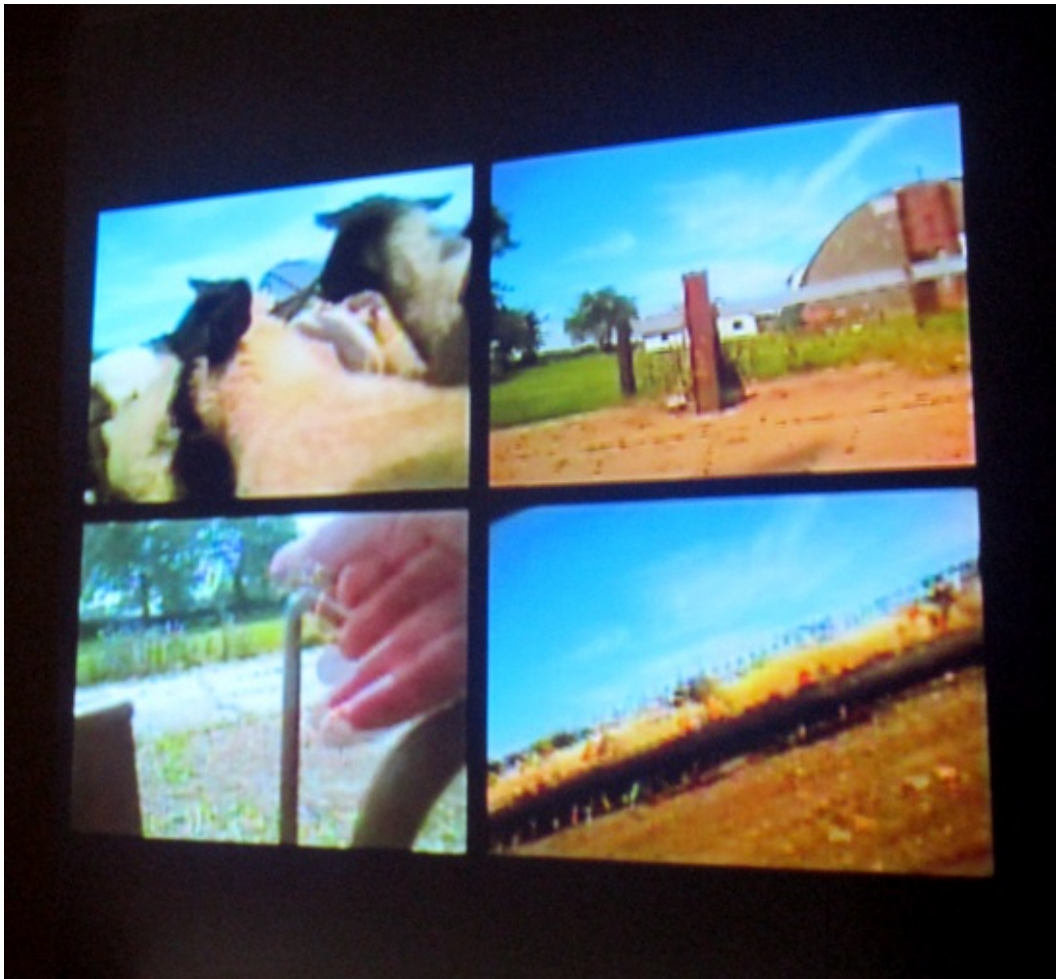
Flock Together video installation

gathered by sheep and a farmer wearing webcams to record and capture a standard day on a working sheep farm. Students listened and really felt as if they were on the farm, recognising sounds and using them to build imaginary visual pictures and related ideas of the experience.