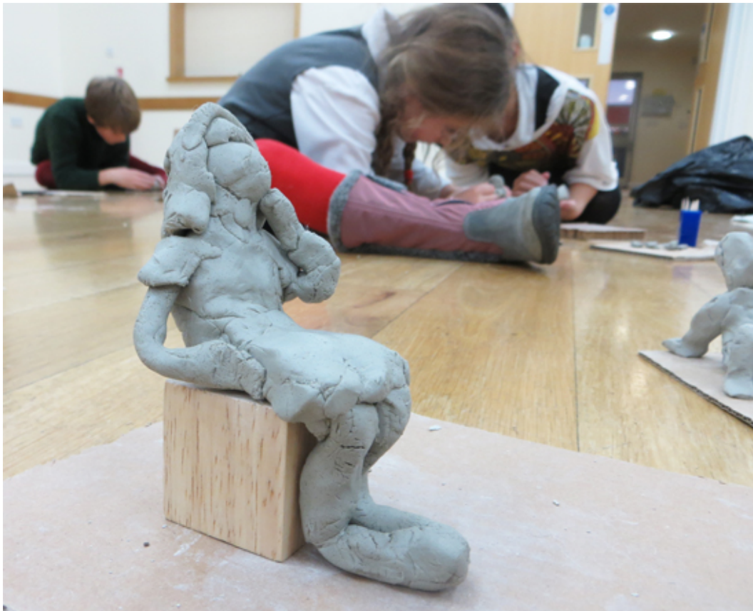
Quick clay figurative sketch

In this session I wanted to give children in my art class for ages 7,8 and 9 the opportunity to create a series of clay "sketches" around a figurative theme.