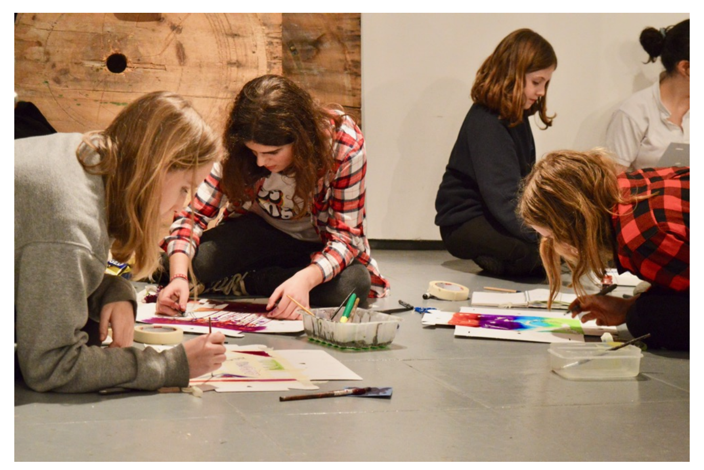
Schools, Colleges, Arts Organisations: Single and Multi-Users From £42

AccessArt is a UK Charity and we believe everyone has the right to be creative. AccessArt provides inspiration to help us all reach our creative potential.