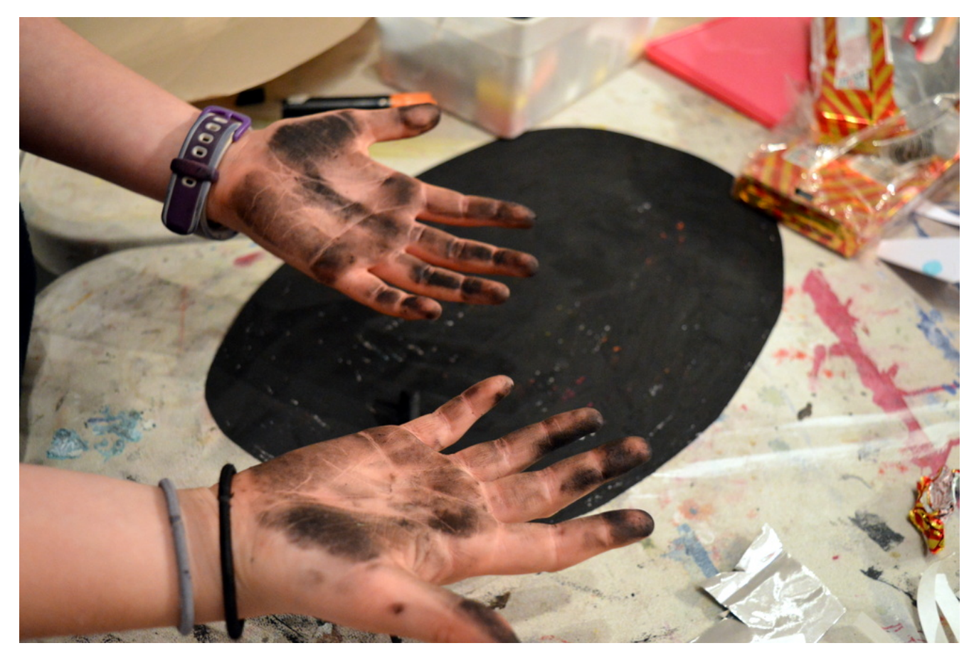
Creative practitioners, educators, teachers, parents, learners...