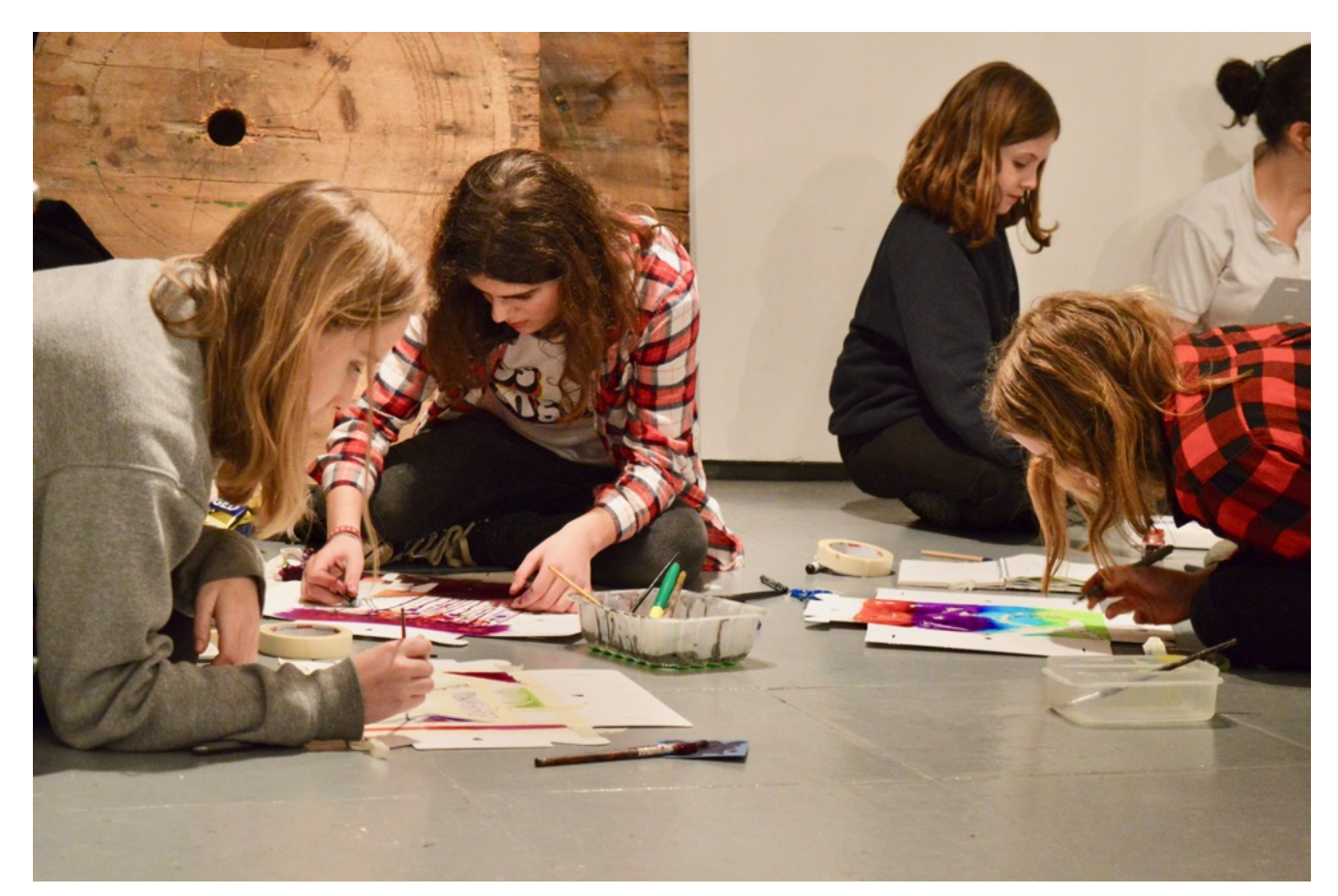
Schools, Colleges, Arts Organisations: Single and Multi-Users From £42

AccessArt is a UK Charity and we believe everyone has the right to be creative. AccessArt provides inspiration to help us all reach our creative potential.