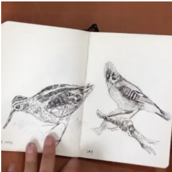
How Artists use their sketchbooks...