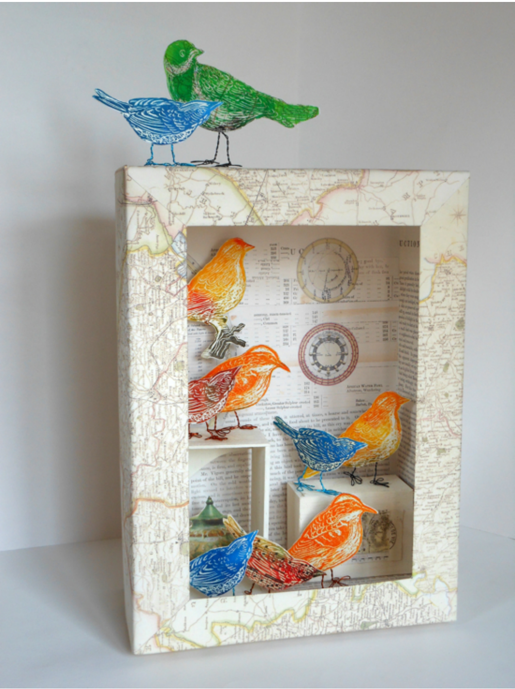
Aviary Box Construction