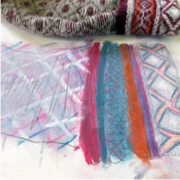
collaging with wax crayon rubbings