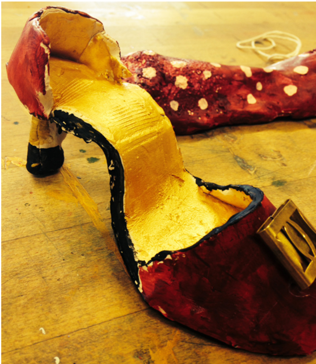
Fancy high heels