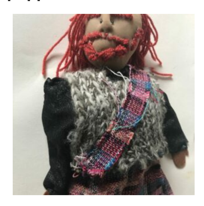
Pop up puppets