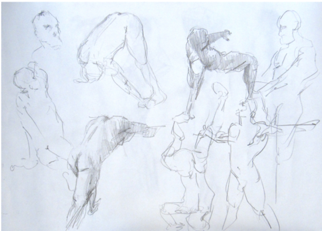
Drawings by Hester Berry

“Gesture” underpins every pose and can give life to the simplest of figure drawings. It is essential for getting information down quickly in short poses, and can give longer poses a sense of spontaneity and movement.