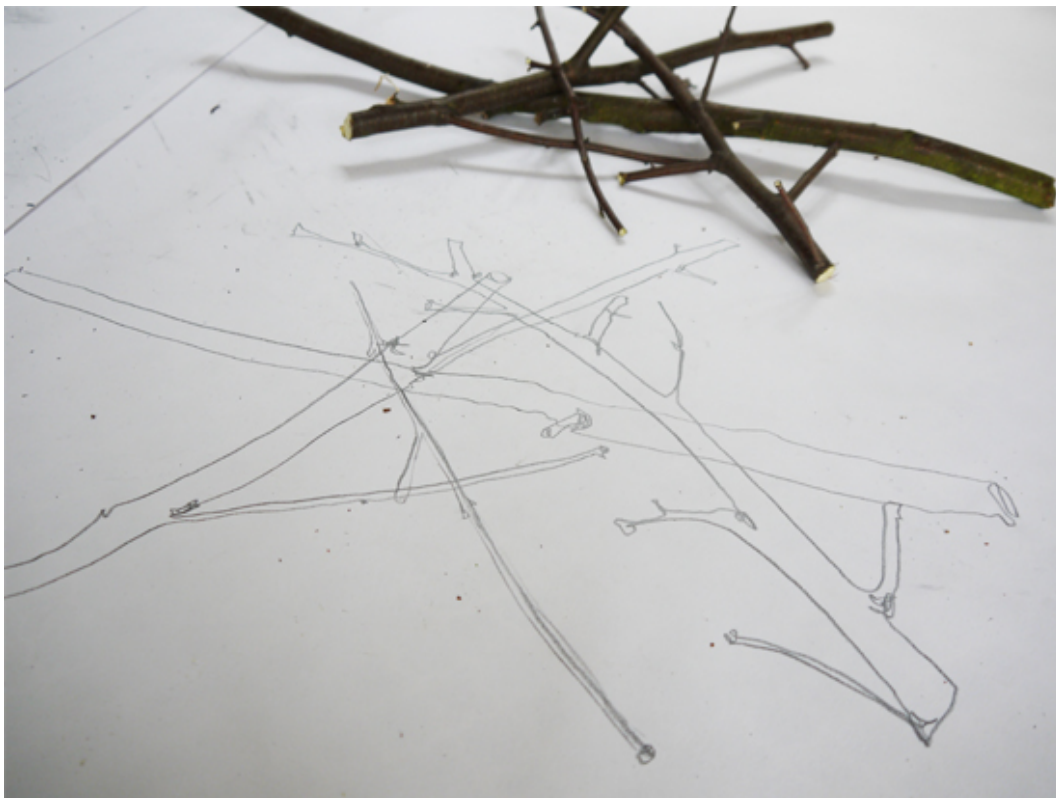
Continuous Line Drawing of a Structure

In contrast to the potential chaos of drawing moving water, in this exercise you are going to first build a structure, which you then draw. Just as you built your knowledge by observing the moving water before you began to draw, in this assignment you are going to build your knowledge of the structure by taking an active part in making it, before you put that knowledge to good use when you make your drawing.