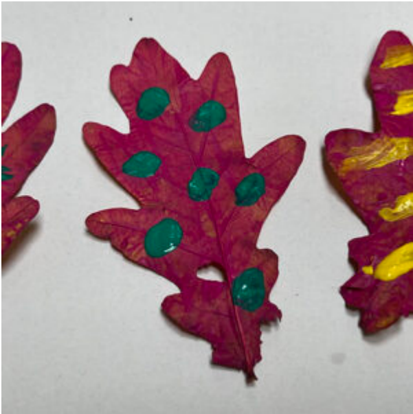
Autumn Floor Textiles