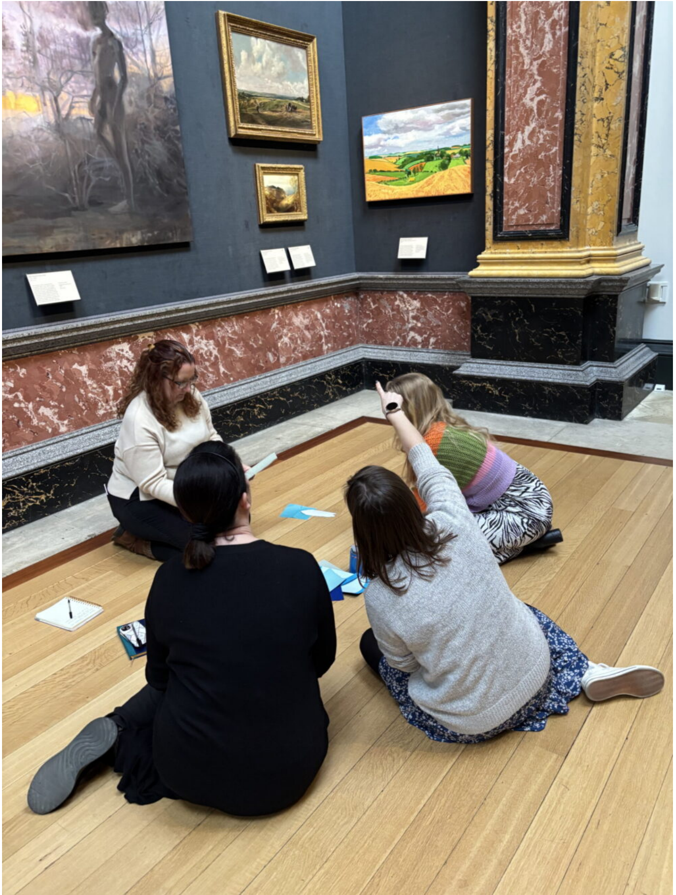
Teachers looking at artworks in the museum.