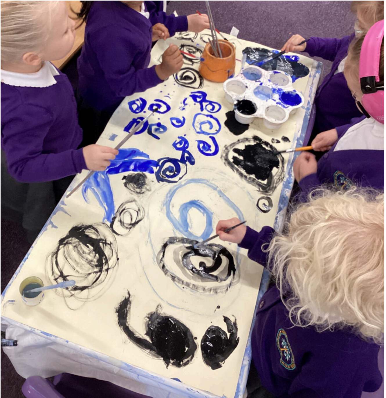
Collaborative artwork at Nene Primary School

Having seen the impact of collaborative approaches to art-making, teachers are now considering ways to build on this further across the curriculum and in new ways: