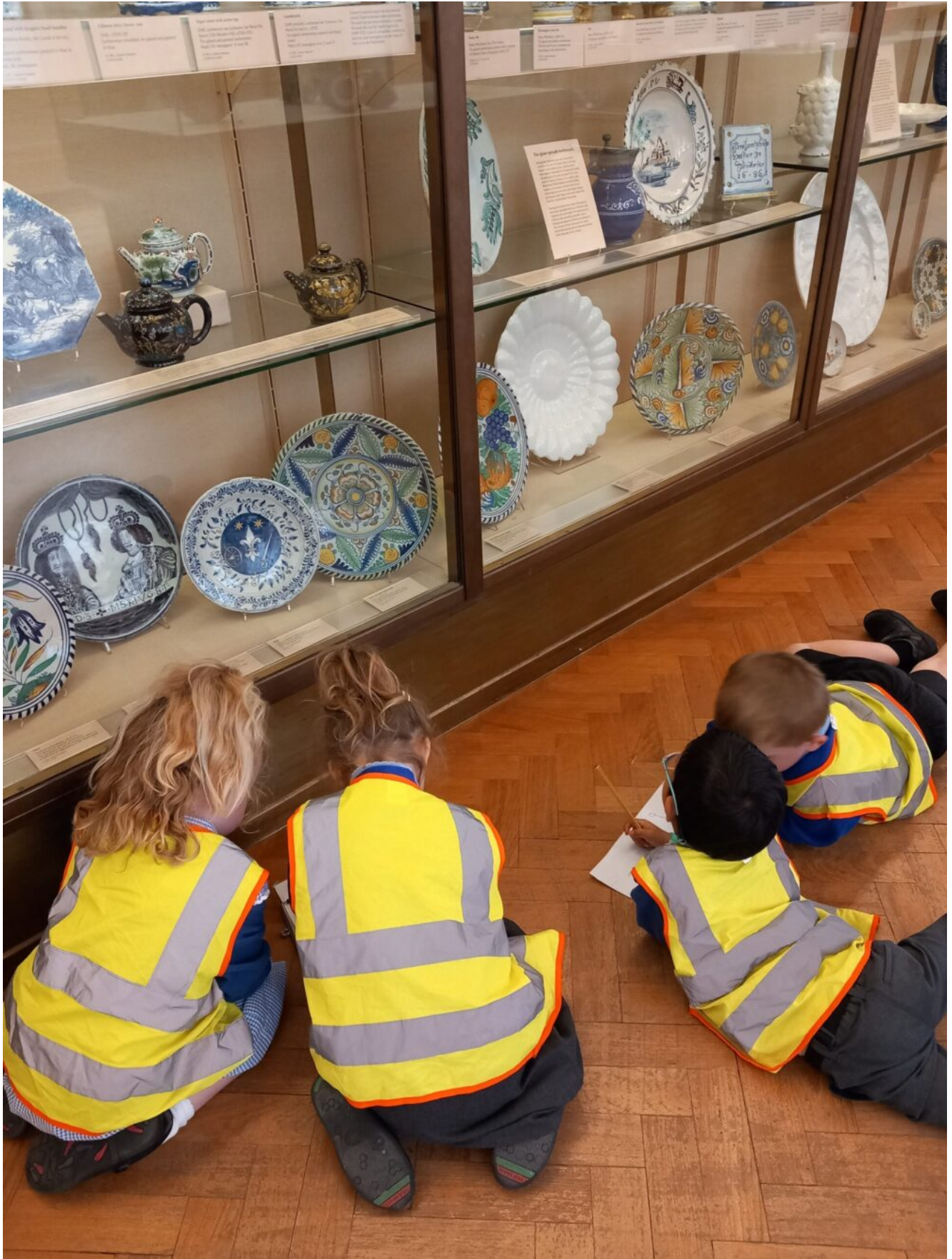
Children from Millfield Primary School visiting the Fitzwilliam Museum.