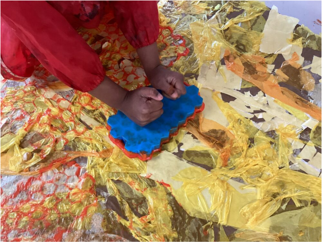
Honeycomb at Highlees Primary School

At Millfield Primary, the focus on nature at the Museum became part of their broader topic on Change. The children recreated a still life arrangement using flowers, fruit leftover from the snack table, and items from around the classroom. Over the next few days they observed and reflected on the changes: