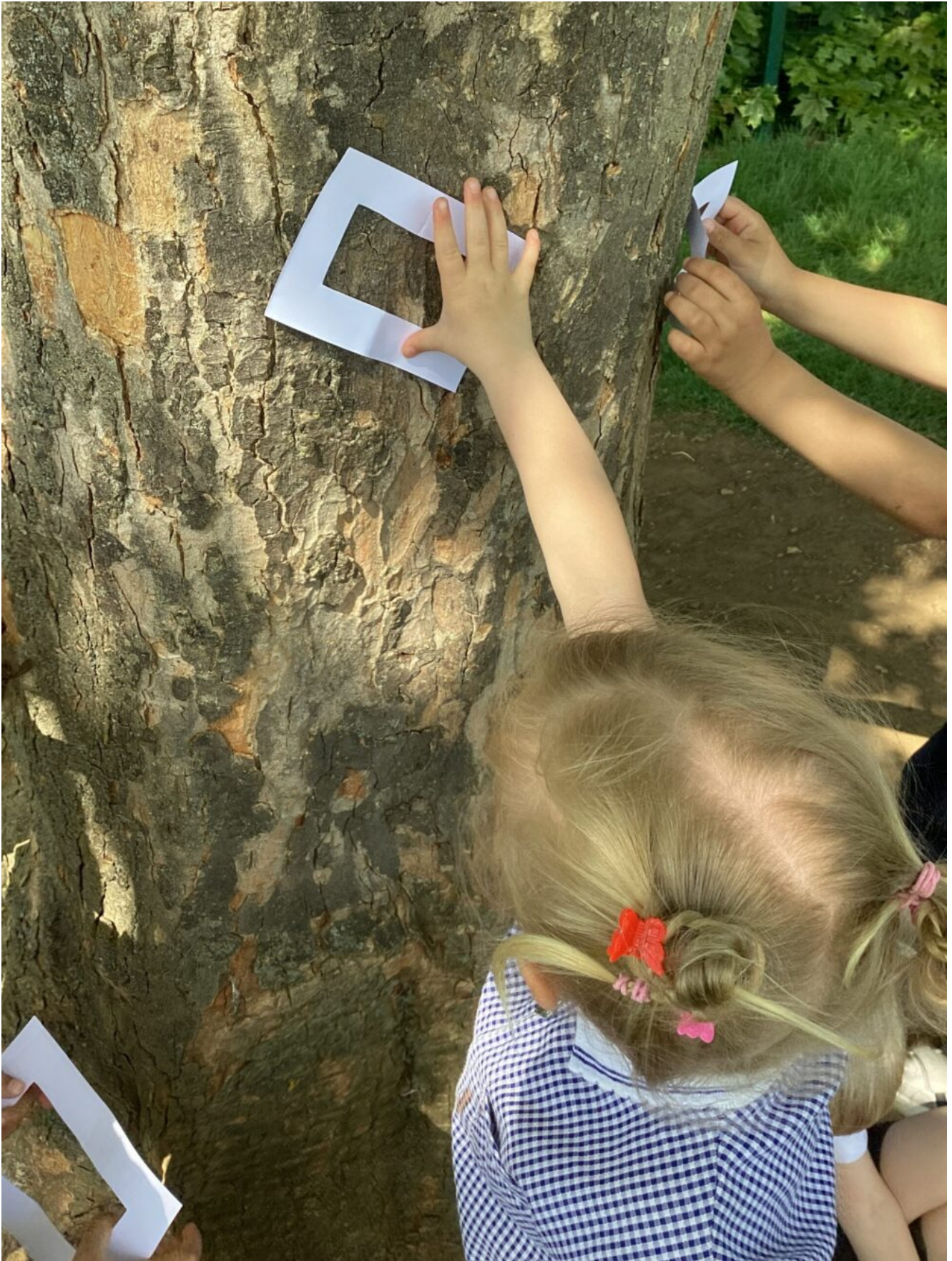
Slow looking and exploration at Highlees Primary School