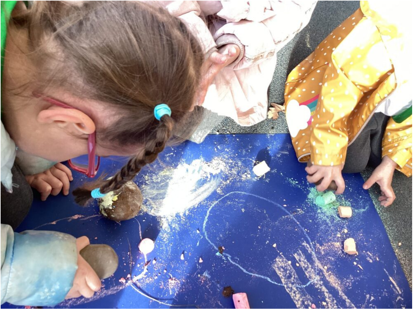
Making together at Nene Primary School