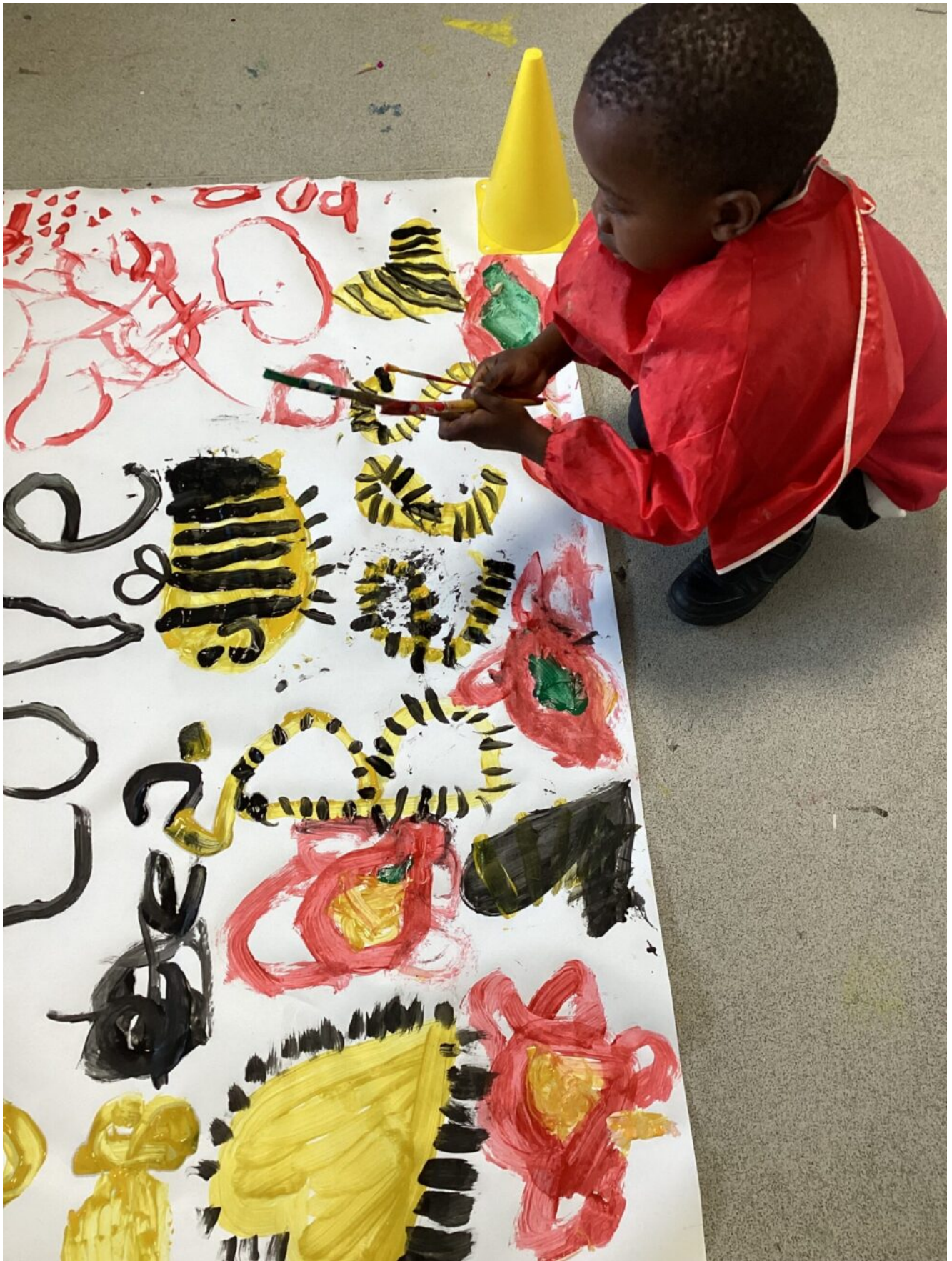
Bees at Highlees Primary School