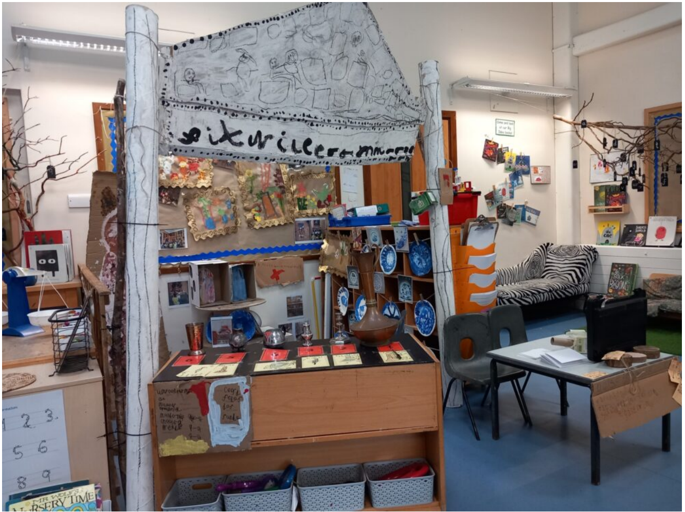
Millfield Primary School installation inspired by natural forms.

The Fitzwilliam Museum and The Elliot Foundation Academies Trust share a belief in the power of art and creativity to drive transformation, support inclusion, and empower educators and learners to thrive. Both organisations see themselves as having a role in providing a nurturing environment for creative practice in all its forms. Across schools in the Trust and at the Museum, we have witnessed this creativity growing and blossoming as adults and children alike grow bold and adventurous in their activities.