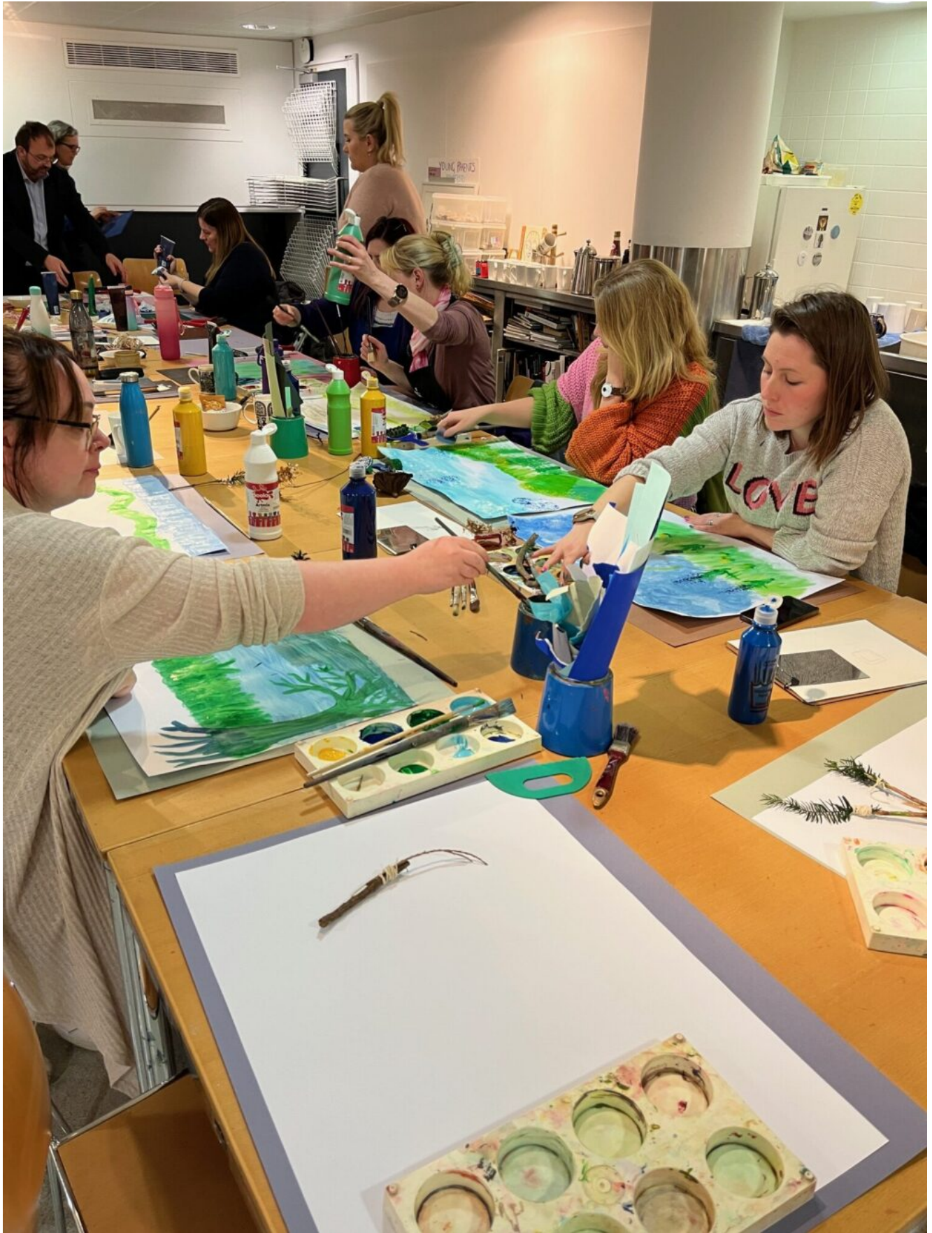
Teachers in the creative studio at the Fitzwilliam Museum.