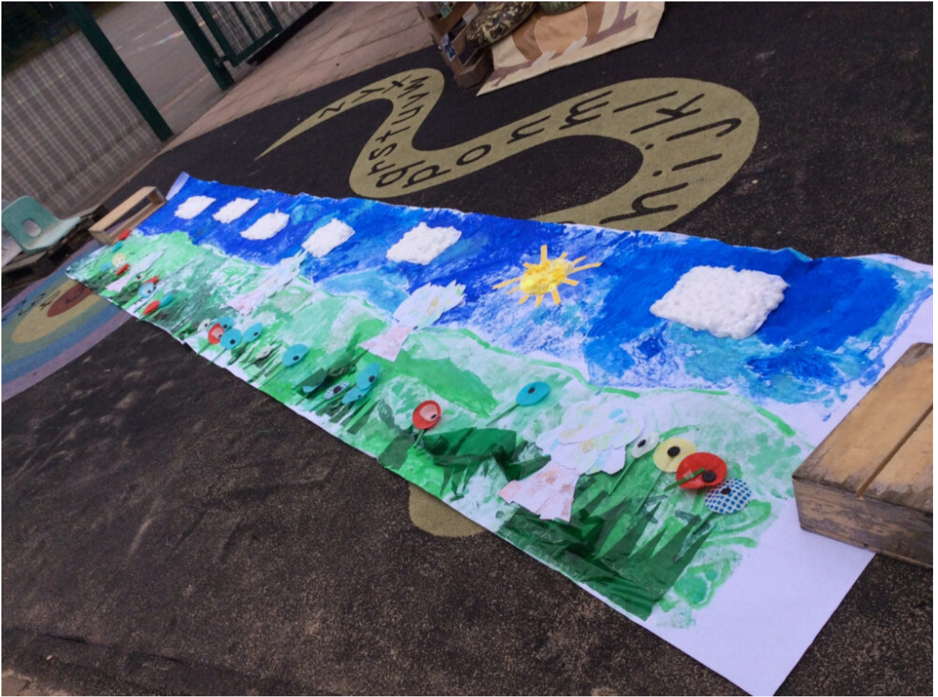
A collaborative artwork at Highlees Primary School.