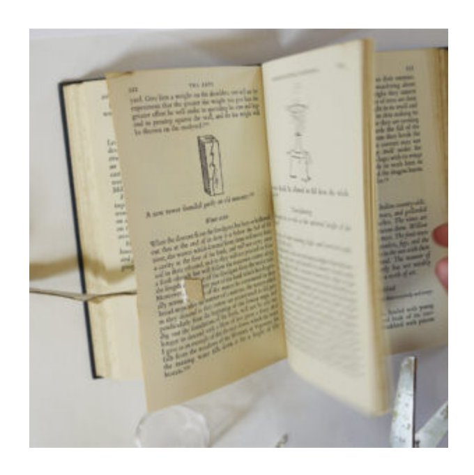
Making 2d & 3d Fashion Designs with Painted and Decorated Paper