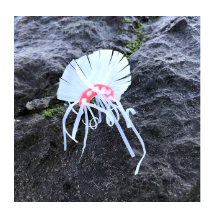
Sea Sculptures from Plastic Bottles