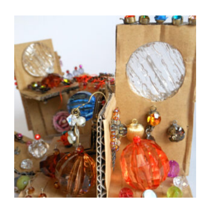
CARDBOARD ENGINEERING CHALLENGE