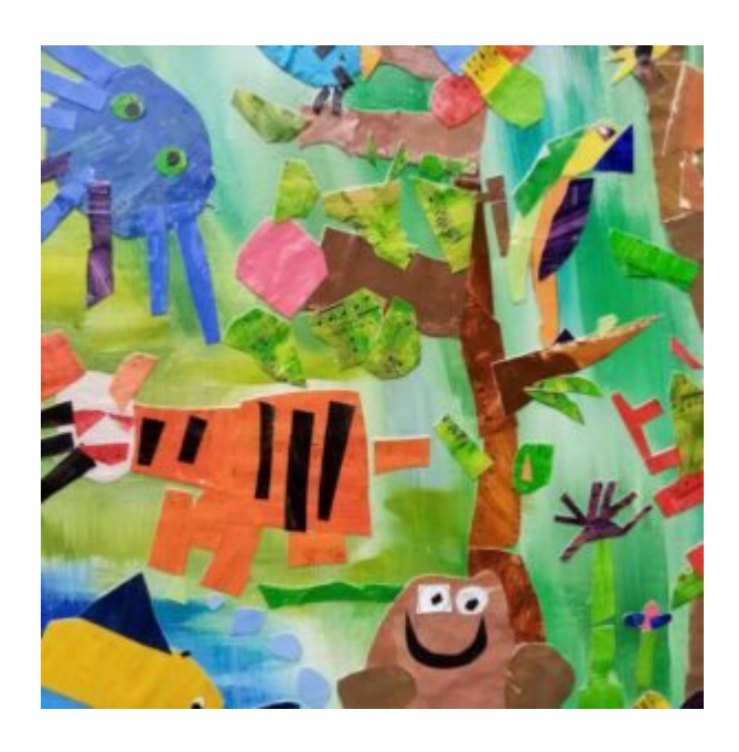
<u>Visual Arts Planning: Our Natural World</u>