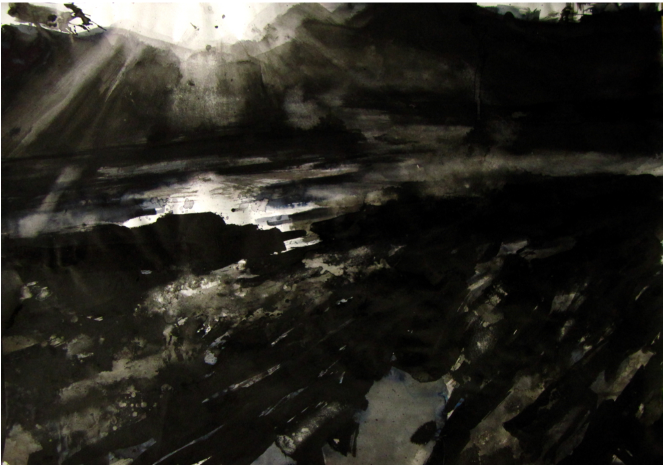
'Ink and Light (VI)', ink on paper by Hester Berry

Tone is a crucial aspect of landscape drawing and painting. I would assert that it is more important than colour in making a convincing depiction of a view. Light is a very real and physical part of a landscape, and a good grasp of tone can really bring a scene to life.