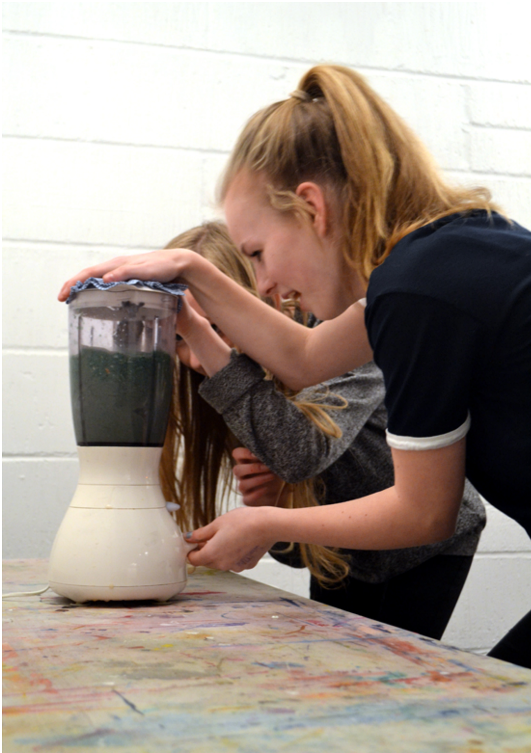
Using an old electric blender to make paper pulp

The energy in the class was electric (literally charged by the electric mixer whirring in the background!) and students loved the tactile experience of playing with water and paper and making paper.