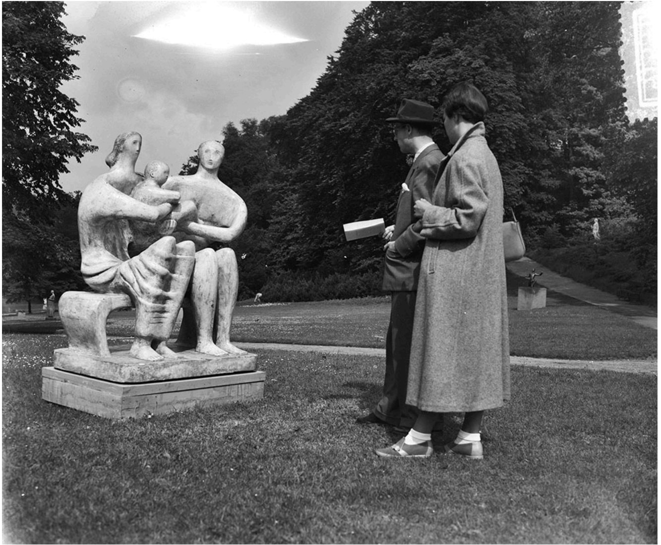
Tentoonstelling beeldhouwwerken Sonsbeek Arnhem. Family Group ( Henry Moore ), Bestanddeelnr 905-1531.jpg

Henry Moore was a sculptor and draughtsman.