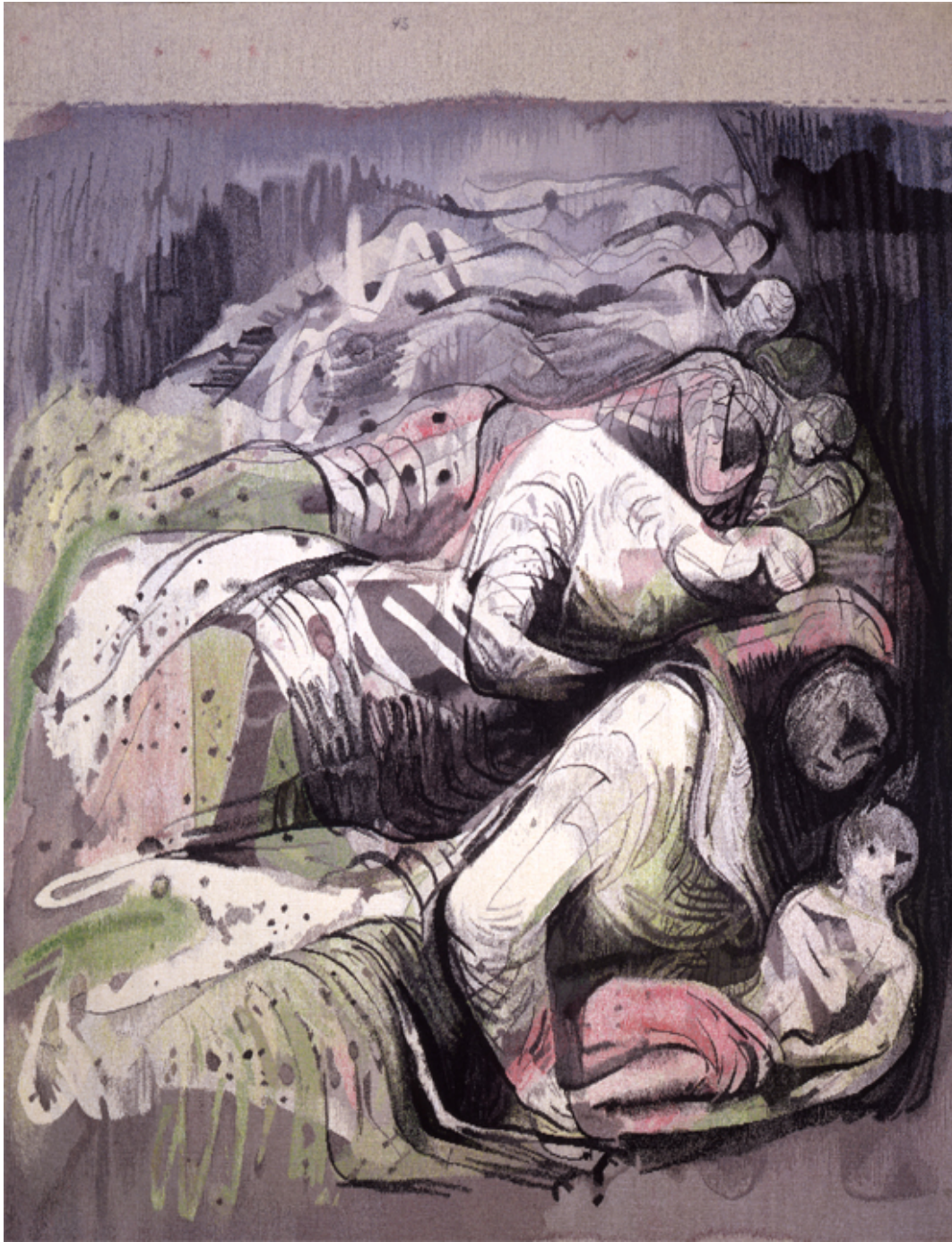
Row of Sleepers 1986 by Henry Moore. Reproduced by the Henry Moore Foundation

Some records say Moore made his shelter drawings after taking shelter one night in 1940 in Belsize underground station, when Moore was fascinated by the families camping out underground. Other records say Moore took many underground journeys and saw the figures in the platforms as the trains passed by.