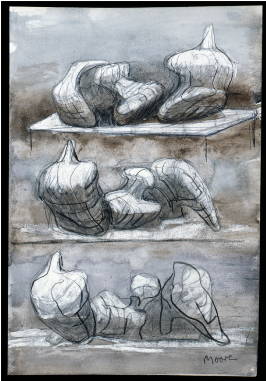
Three Reclining Figures 1975 HMF 75(8) watercolour wash, charcoal, chalk, gouache on blotting paper 263 x 217mm photo: The Henry Moore Foundation archive, Michel Muller. Reproduced by kind permission of the Henry Moore Foundation