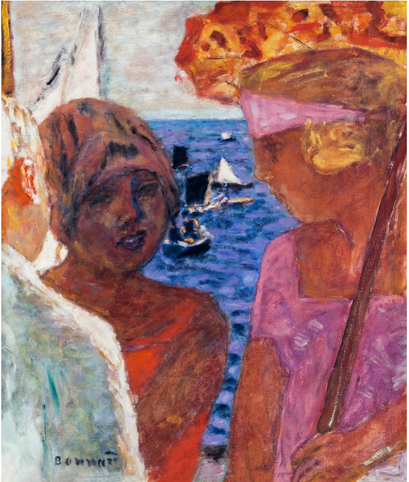
Conversation in Arcachon (1926-1930) painting by Pierre Bonnard.