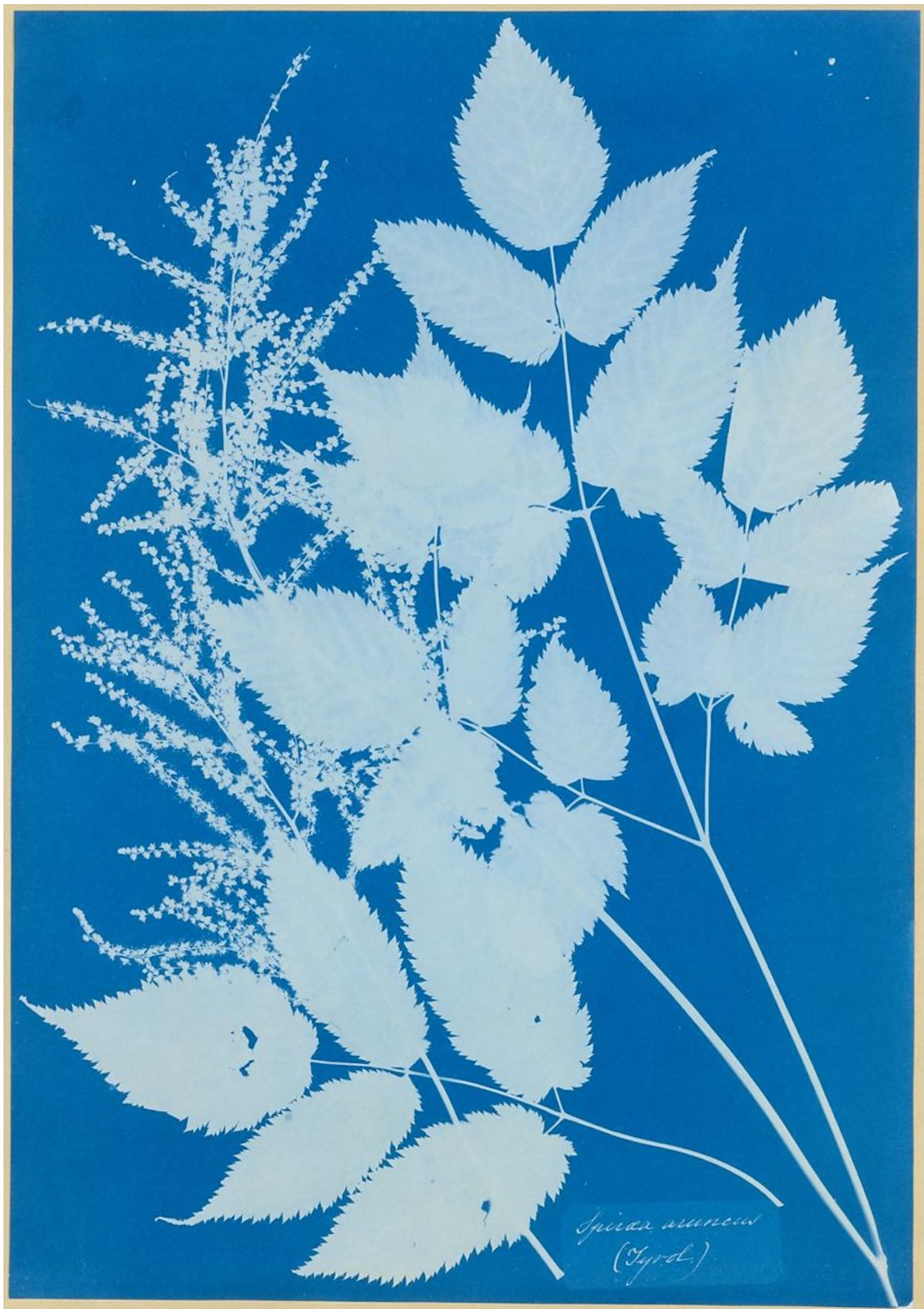
Spiza arvensis (Tyrol.)