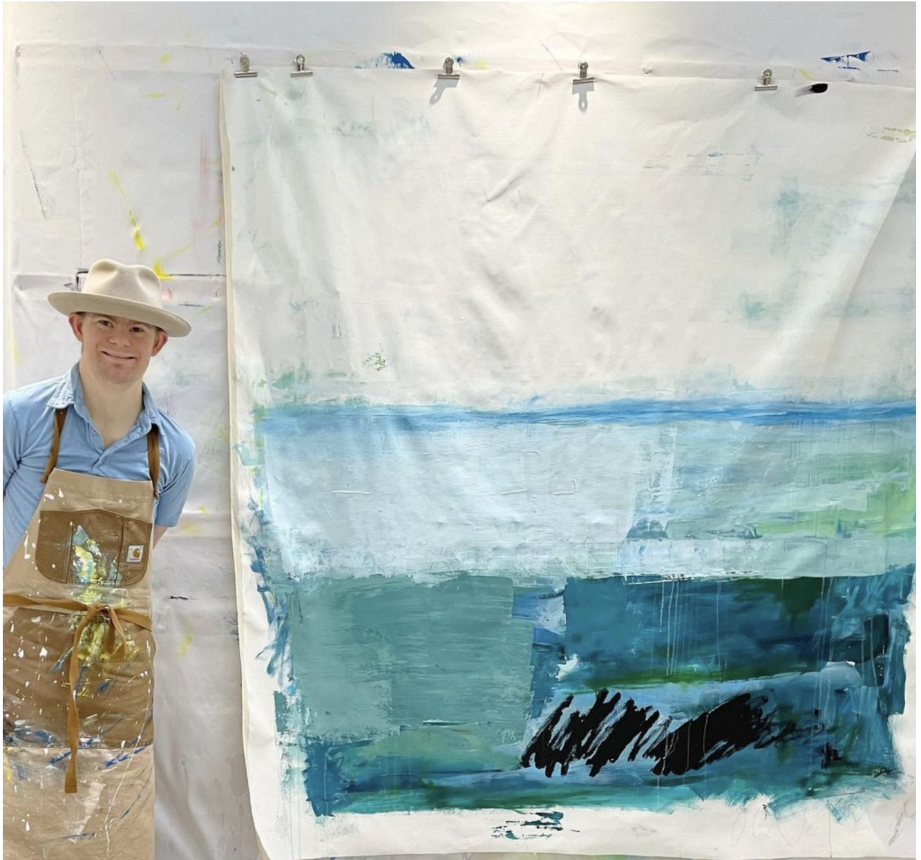
In the Fathoms Below