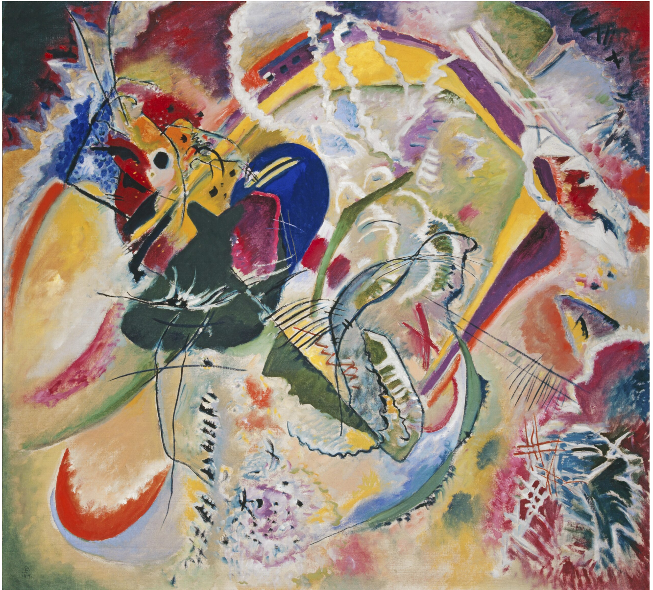
Improvisation 35 (1914) painting by Wassily Kandinsky

Watch the video with the pupils, and look at the images below. Find out how you can respond to art through dance.