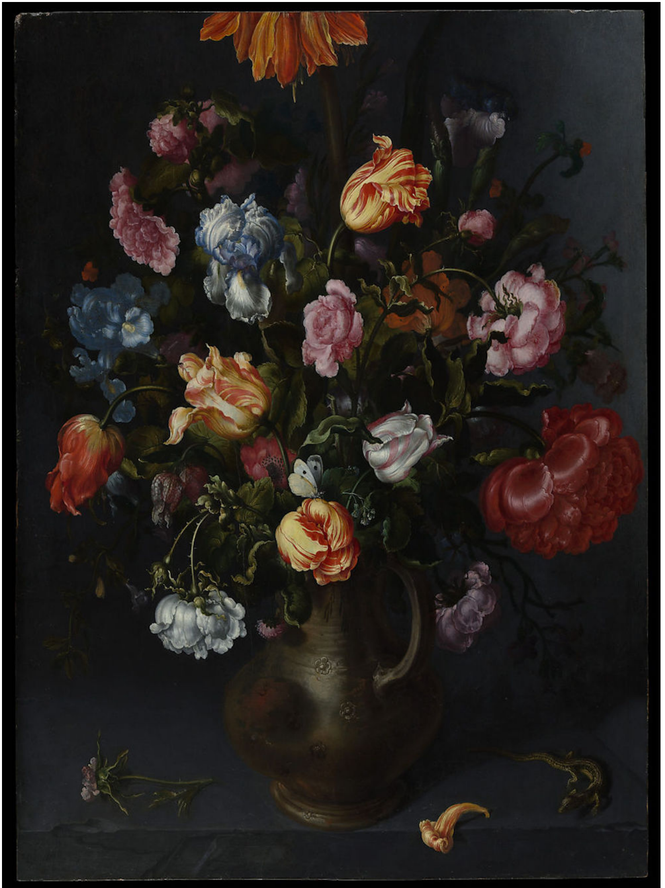
A Vase with Flowers, Jacob Vosmaer (Dutch, Delft