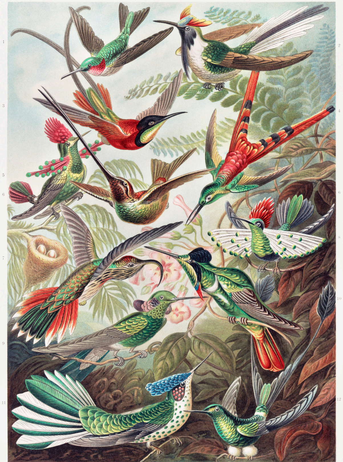
Trochilidae. — Solibris.