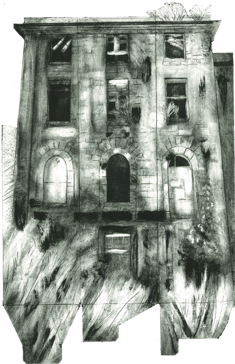
Commodore Hotel, Collagraph print, H 380 x W 280 mm