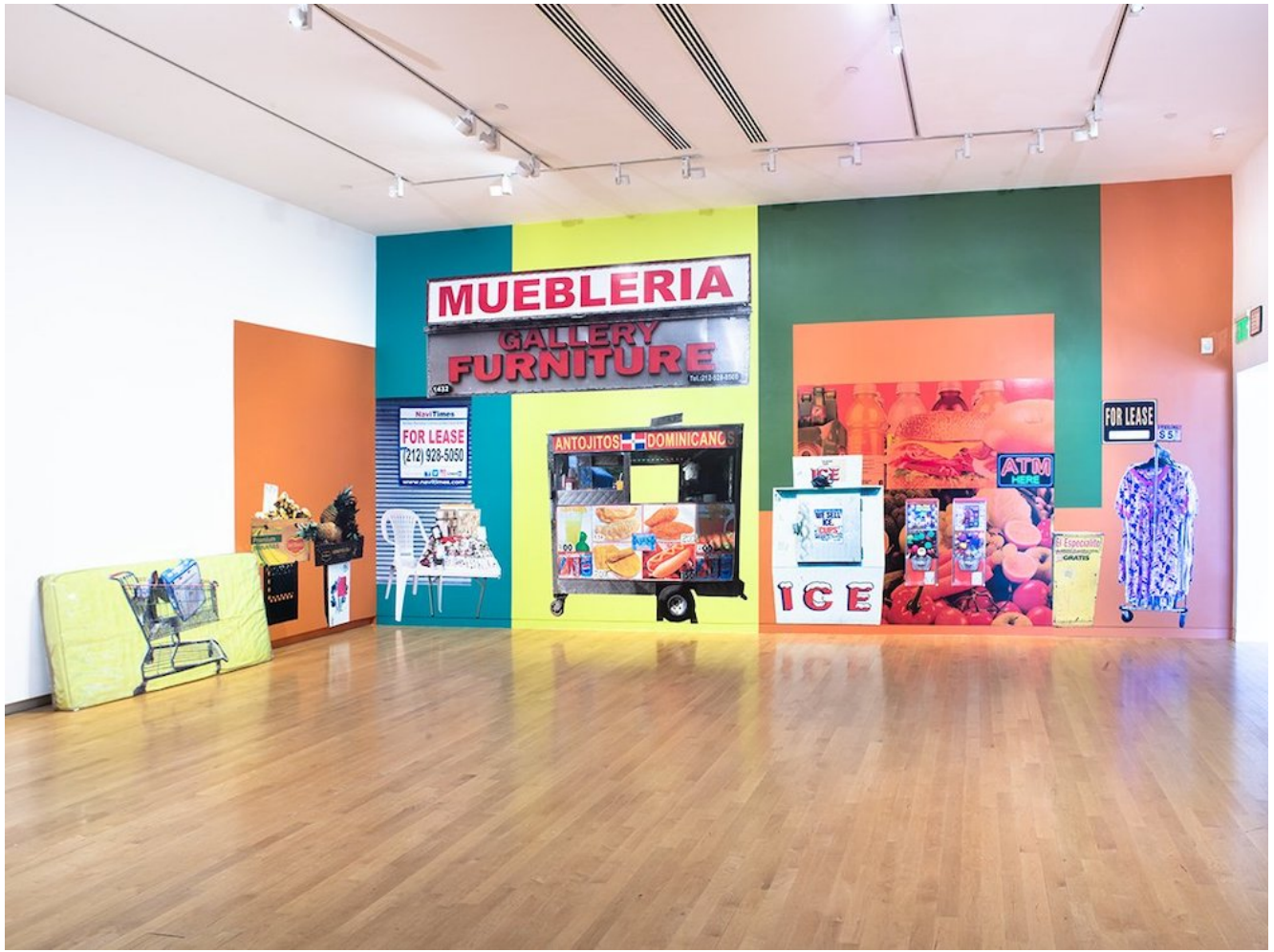
Marginal Costs Mural & Casita 2021 Digital Print on Cotton Fitted Sheets, Upholstered Twin Mattress 39 x 76 x 5