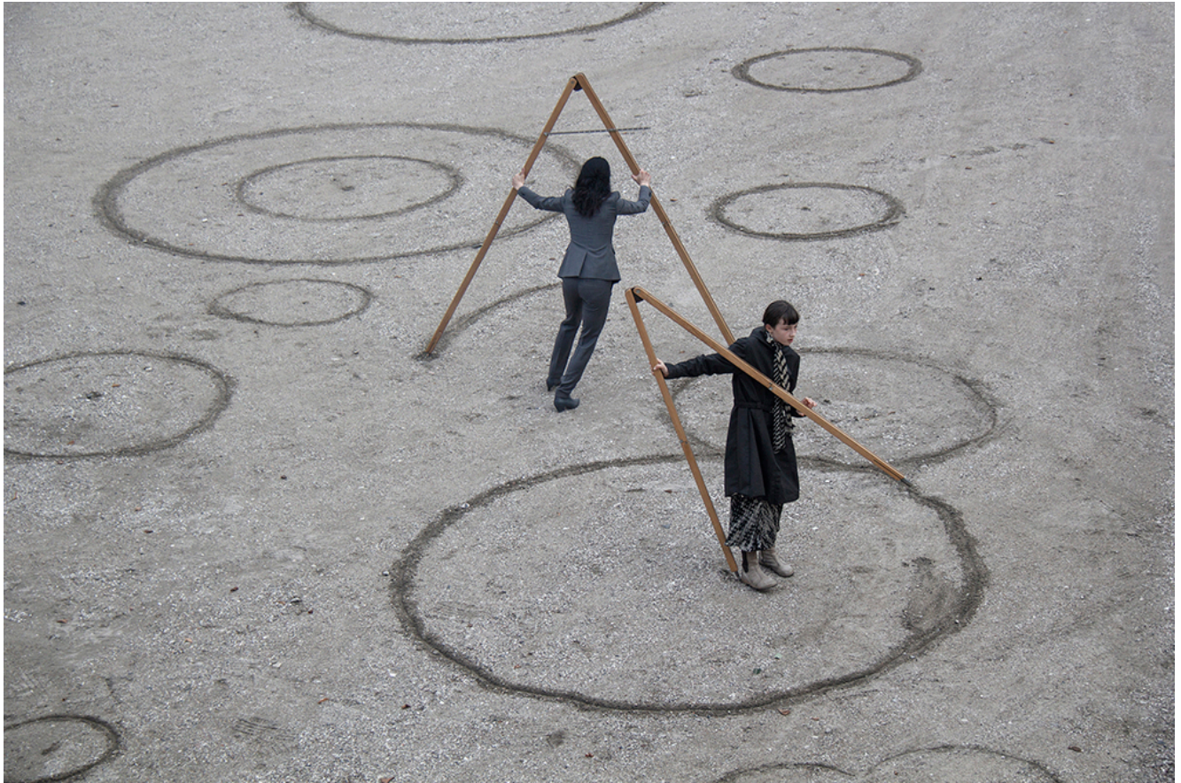
Circles (2013), Molly Haslund, Museum of Contemporary Art, Roskilde, Denmark