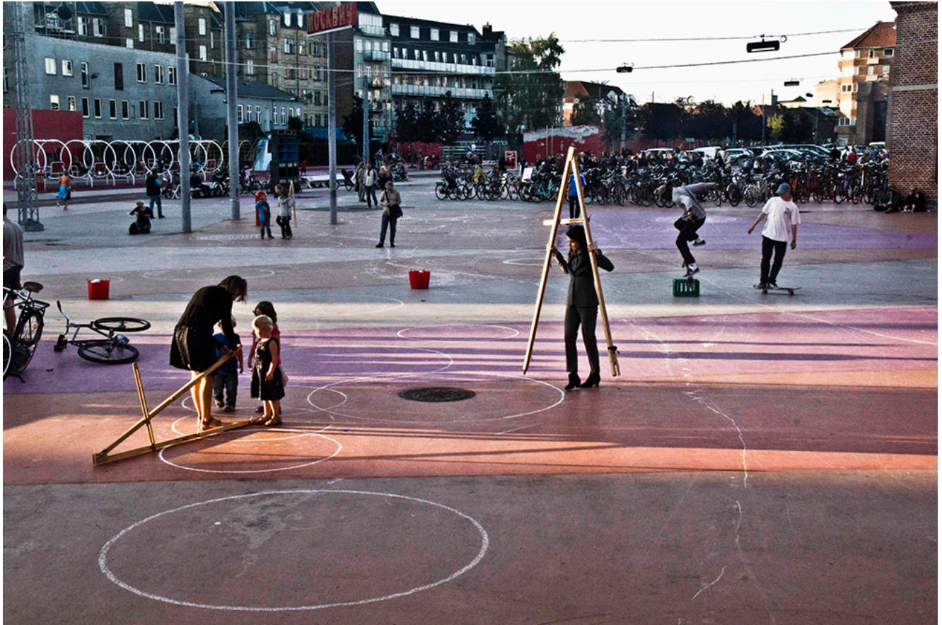
Circles, Molly Haslund, 2014, Art Week, Superkilen, Copenhagen, Denmark, Photo by Matilde Haaning