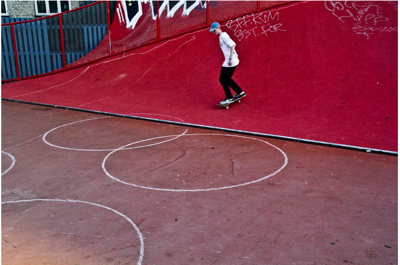
Circles, Molly Haslund, 2014, Art Week, Superkilen, Copenhagen, Denmark