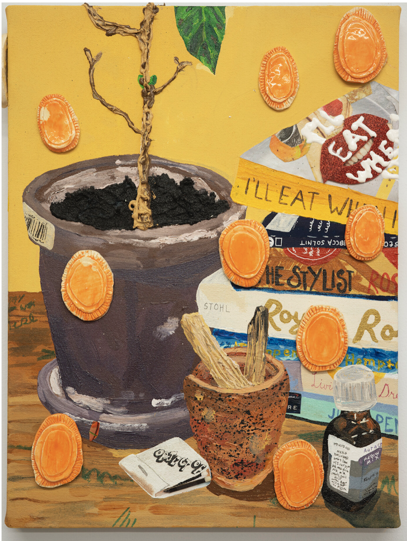
Ladies, Ladies, Ladies, 2018 Acrylic, ink,