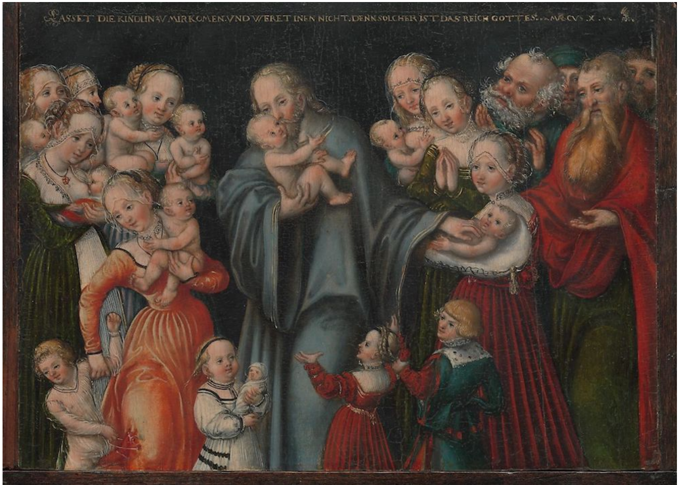
Lucas Cranach the Younger and Workshop (German, Wittenberg 1515–1586 Wittenberg) The Metropolitan Museum of Art, New York