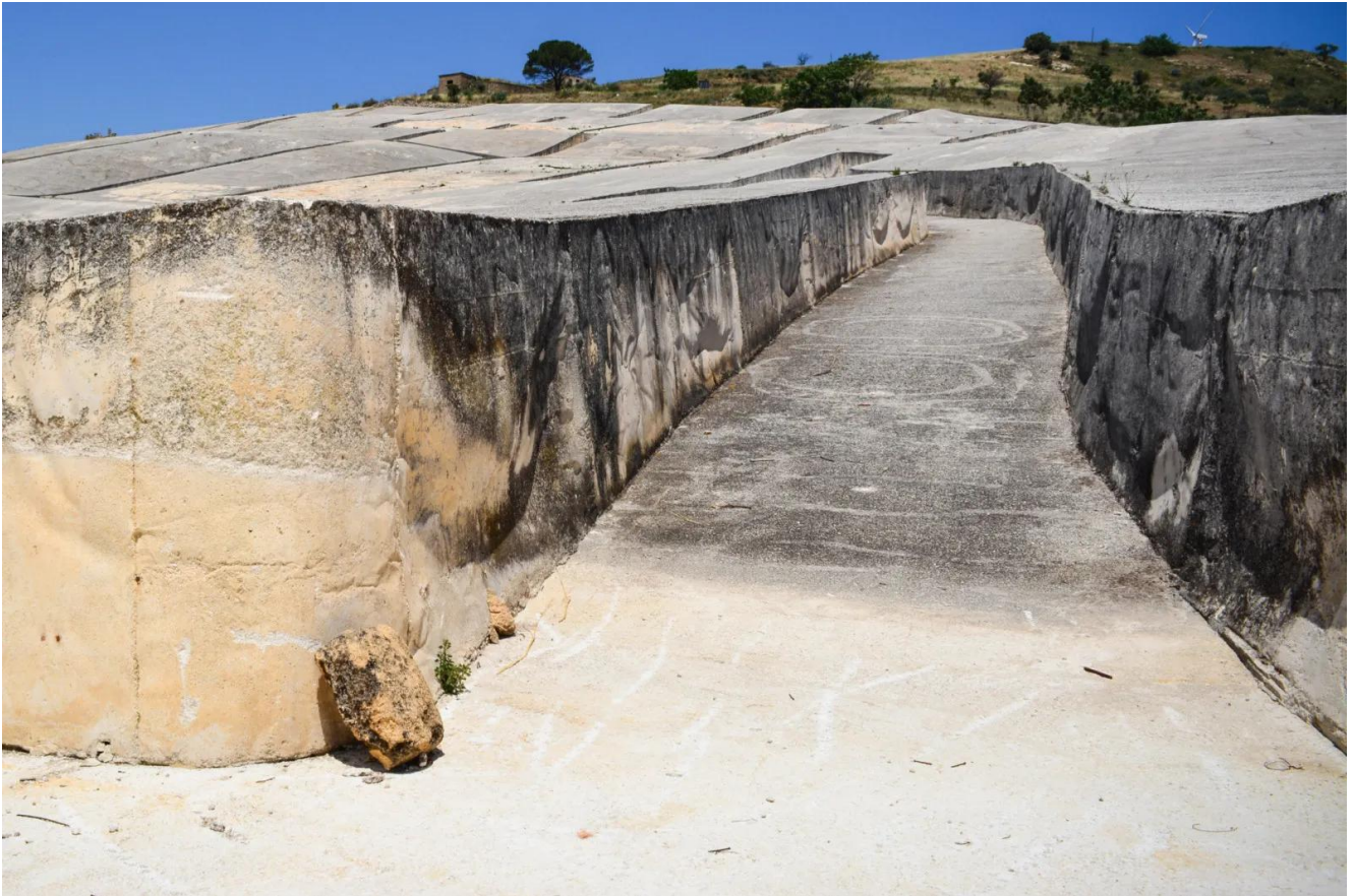
Alberto Burri – Cretto di Burri (Crack of Burri) , 1984–2015, concrete, 1.50 x 350 x 280 m (4.9 x 1,150 x 920 ft), Gibellina, Sicily, Italy