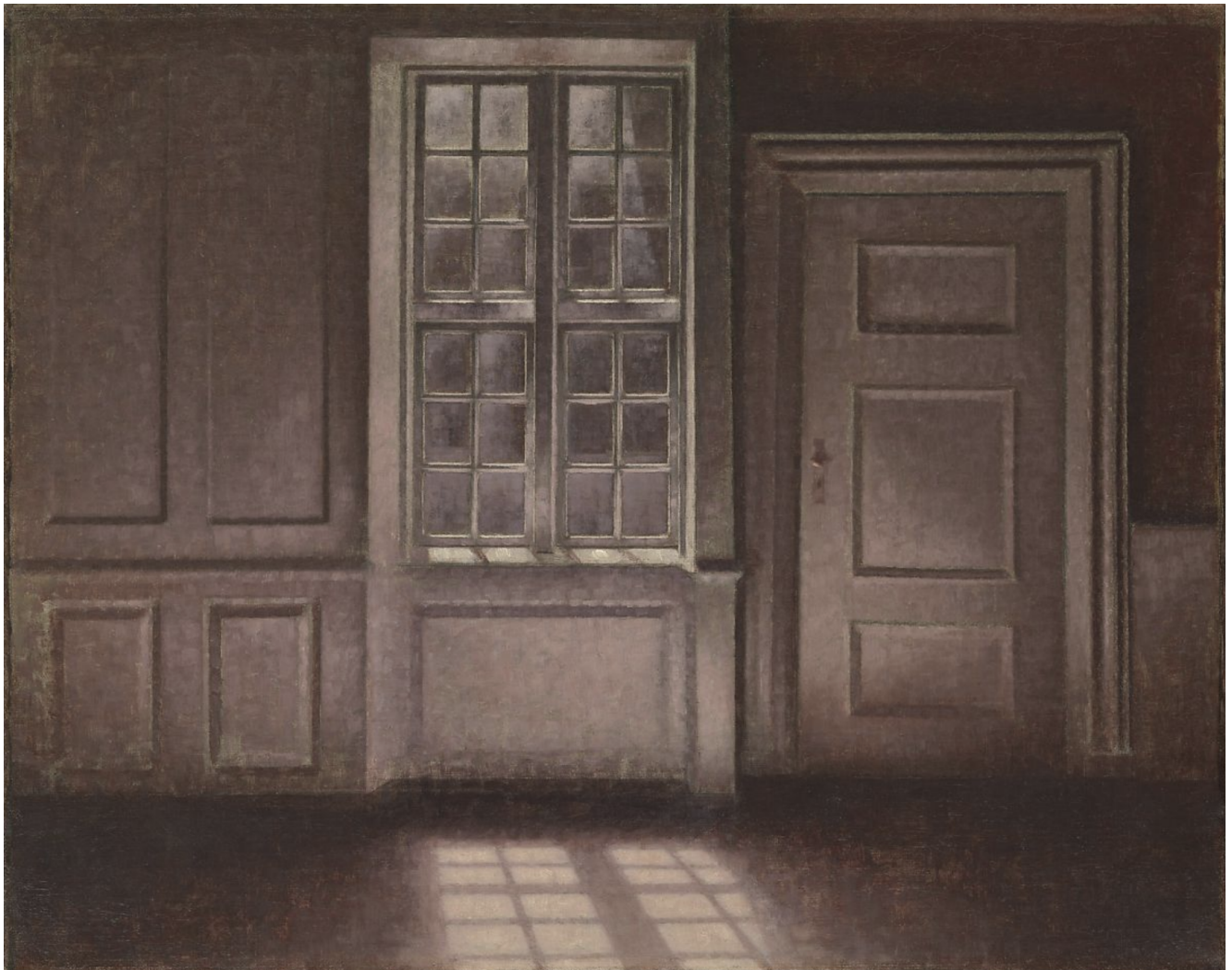
Moonlight, Strandgade 30, 1900–1906 Vilhelm Hammershøi

by Odilon Redon . Original from the Art Institute of Chicago