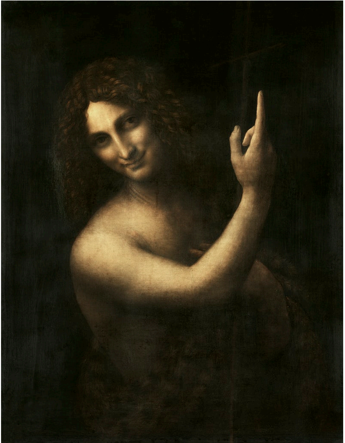
Leonardo da Vinci 's Saint John the Baptist (1513-1516)