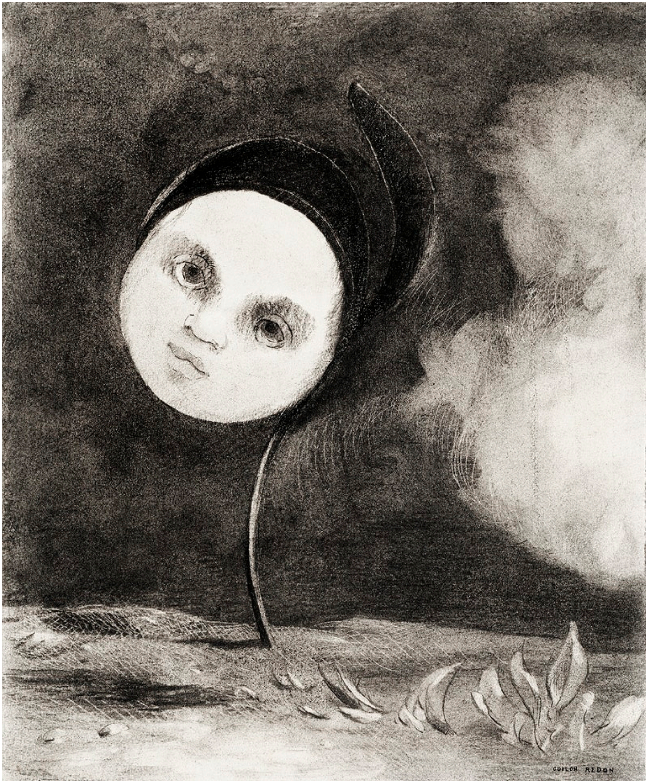
Strange Flower (Little Sister of the Poor) (1880)

Art UK: The Superpower of Looking explores Joseph Wright of Derby's An Experiment on a Bird in the Air Pump