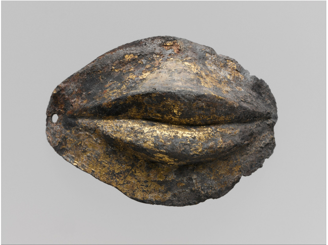
Cypriot Silver-gilt mouthpiece 6th–5th century B.C.